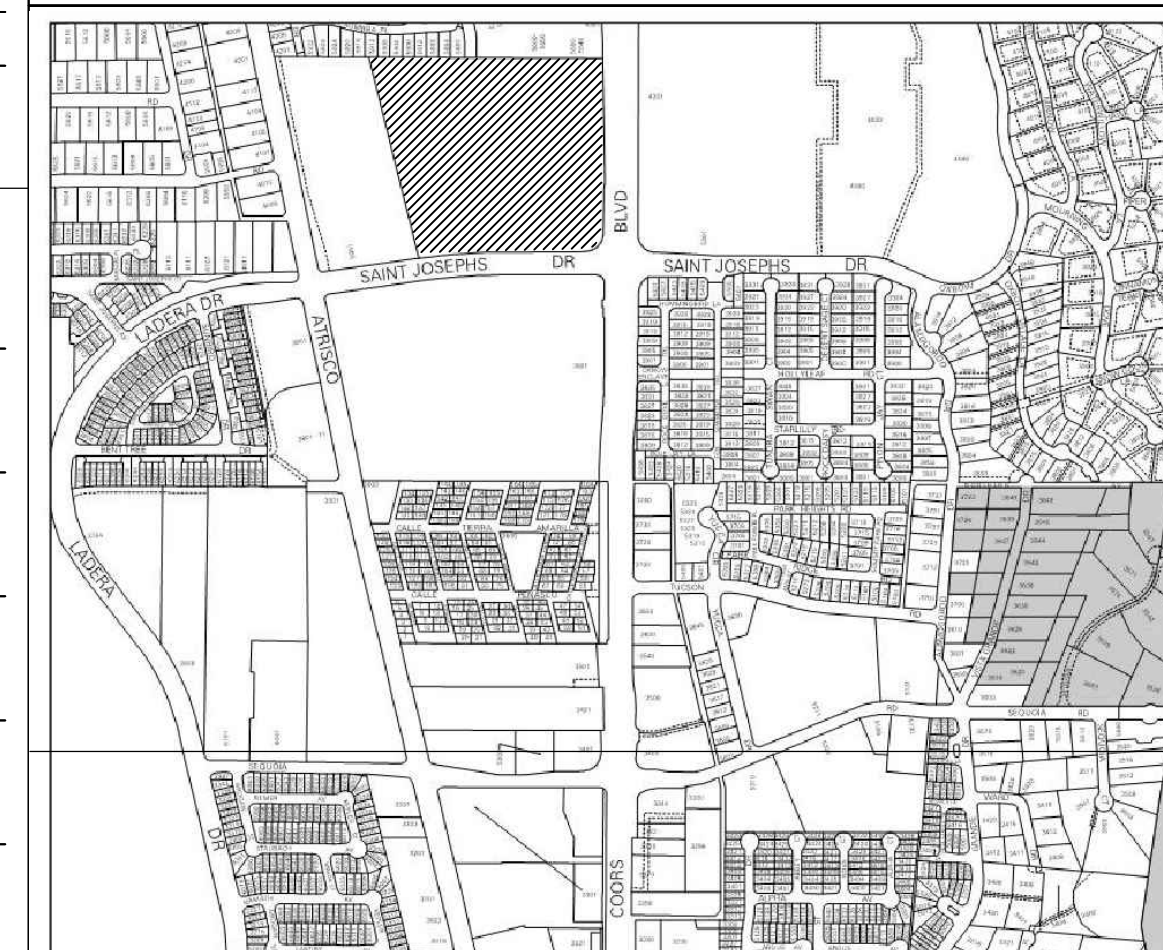
Zone Atlas Map G-11-Z nts