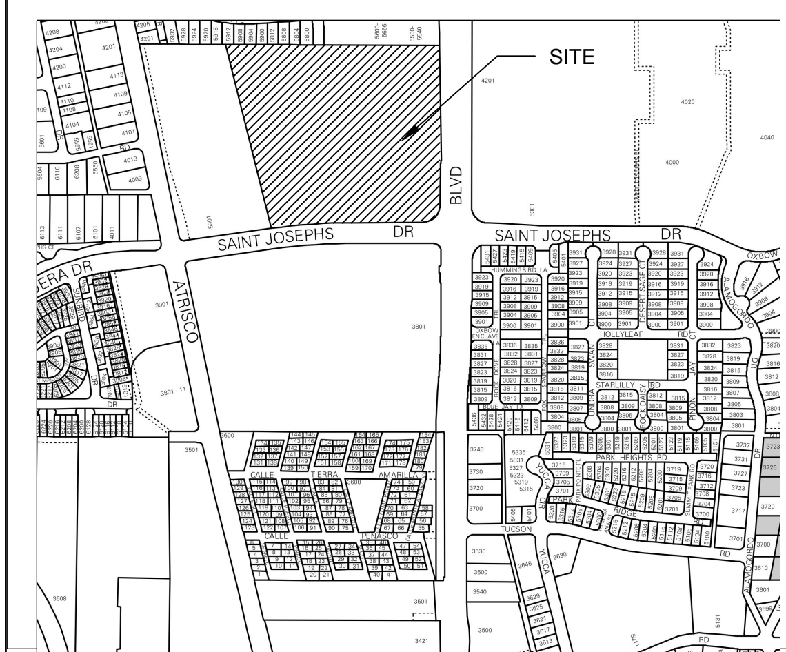
VICINITY MAP Zone Atlas Map G-11-Z nts