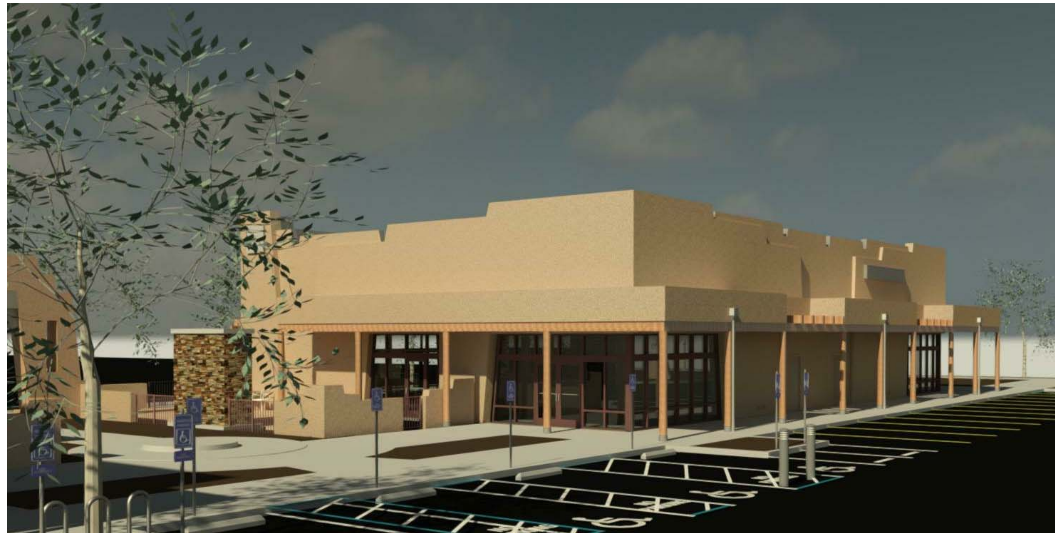
NOTE: IMAGE IS CONCEPTUAL IN NATURE AND MAY NOT DEPICT THE REQUIREMENTS OF THE DRAWINGS AND SPECIFICATIONS

BIKE SPACES (BUILDING B): BIKE SPACE PER 20 PARKING SPACES PROVIDED: 4.4 10