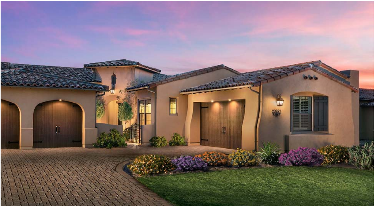
La Cuentista Subdivision Tract B-2, Driveway Access Example