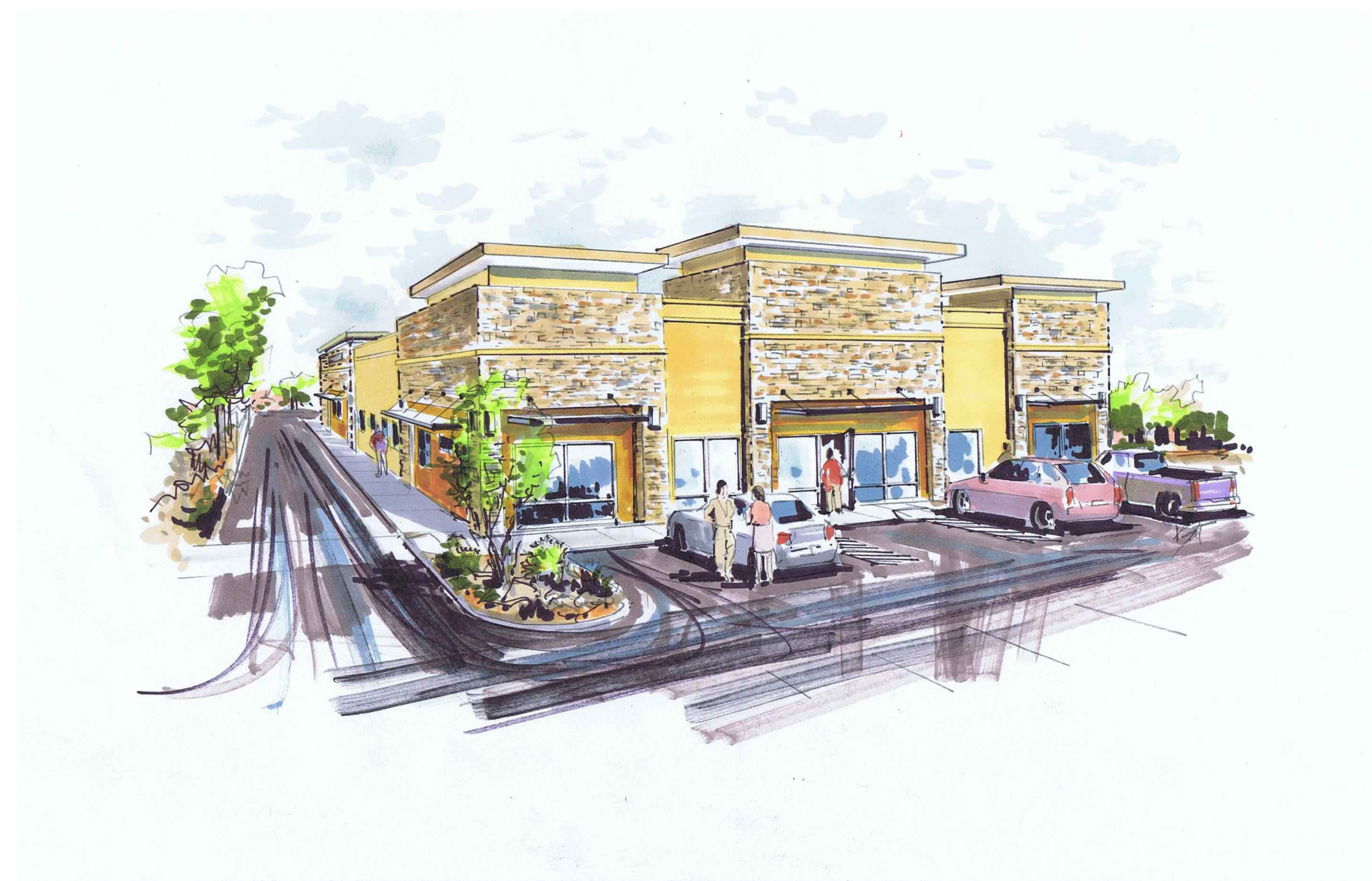
RENDERING - FRONT ENTRY NO SCALE