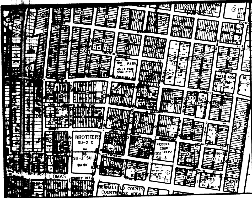
VICINITY MAP No. J-14