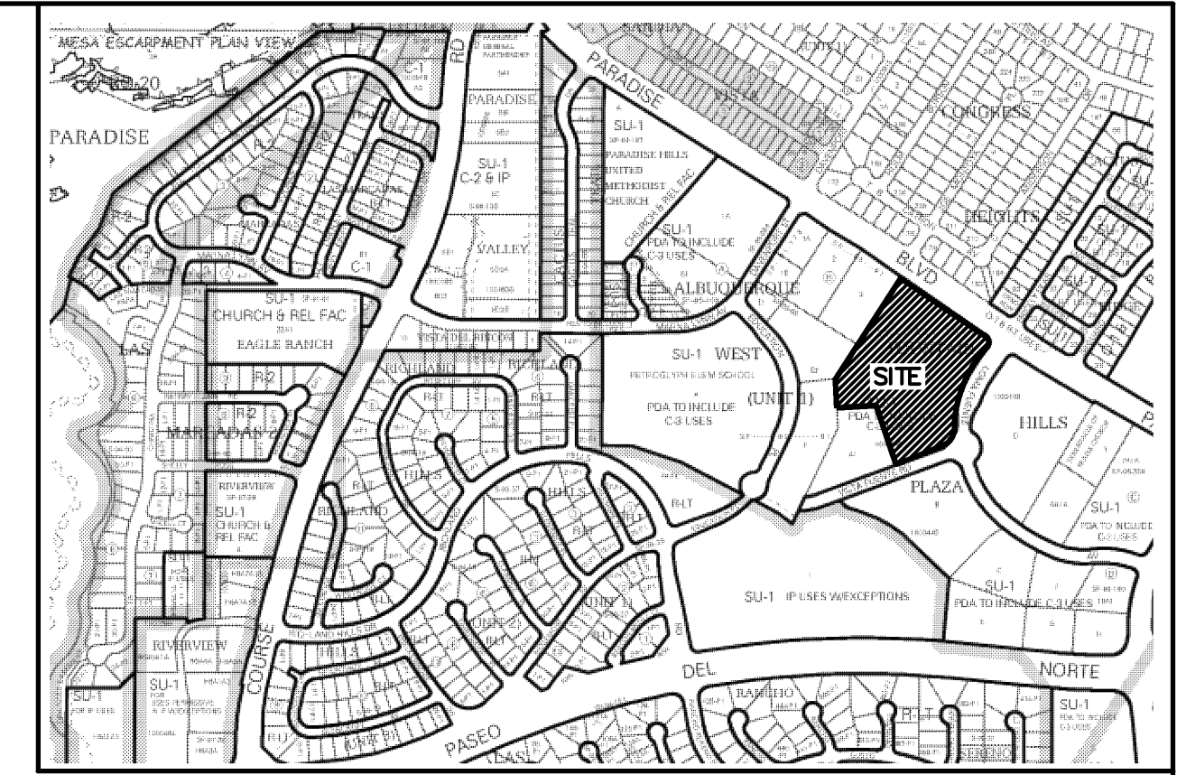
VICINITY MAP: C-12-Z

LEGAL DESCRIPTION: TRACT A-2 FOUNTAIN HILLS PLAZA CONTAINING 7.0005 ACRES ZONING: SU-1 FOR PDA TO INCLUDE C-3 USES ADDRESS: 4590 PARADISE BLVD NW