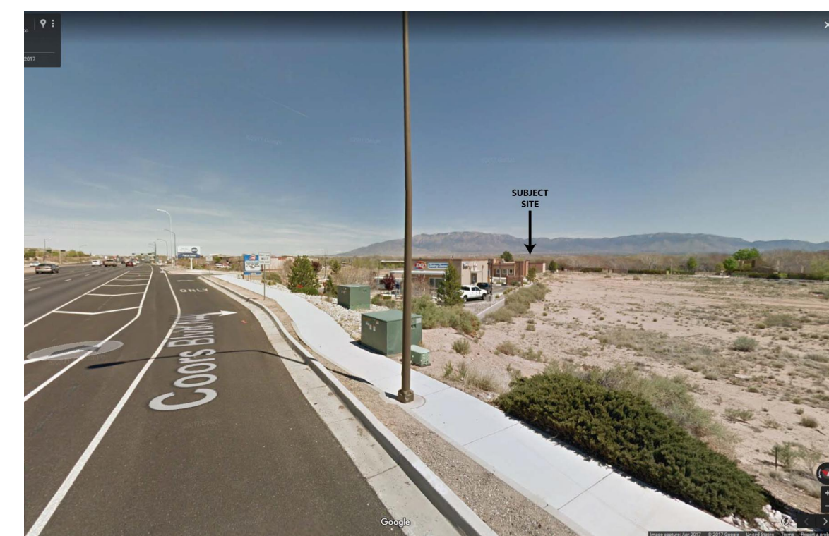
C4 SUBJECT SITE IMAGE NTS

*MAXIMUM BUILDING HEIGHT PER C1 ZONING IS 26', THEREFORE PROPOSED BUILDING SHALL NOT EXCEED 26 FEET IN HEIGHT