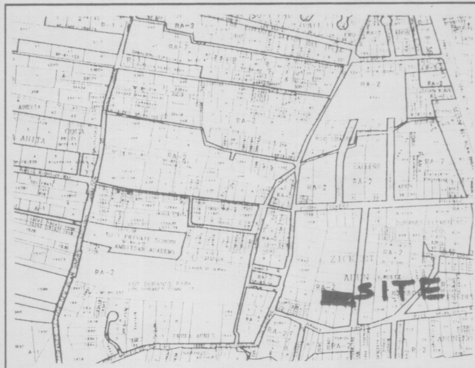
VICINITY MAP No. H-12