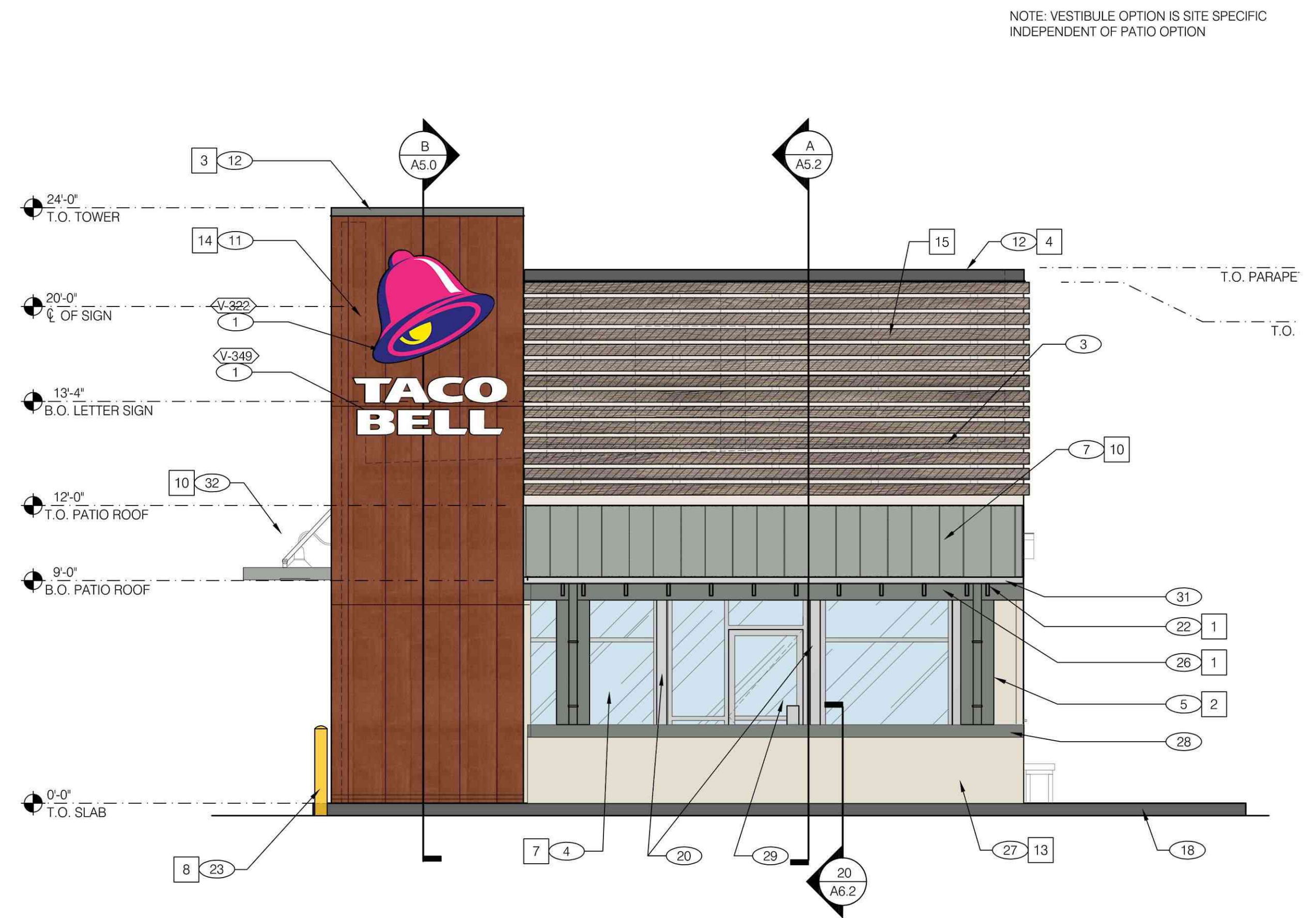
(WEST) FRONT ELEVATION 1/4" = 1'-0" C