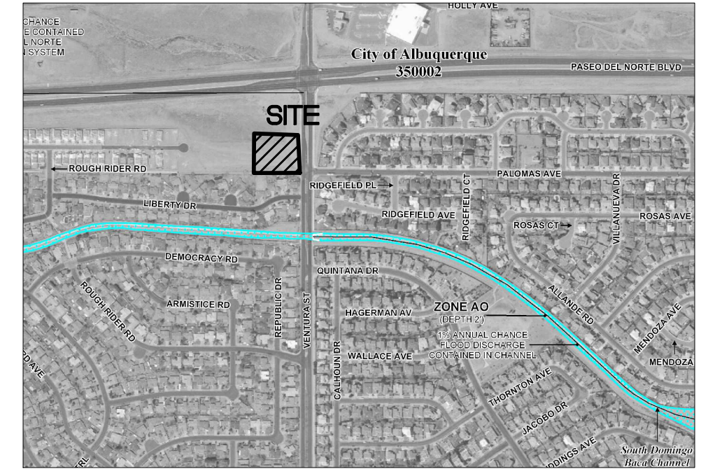
FIRM MAP 35001C014IG

LEGAL DESCRIPTION: A Portion of Parcel A, Ventura Plaza. 0.64 Acres.