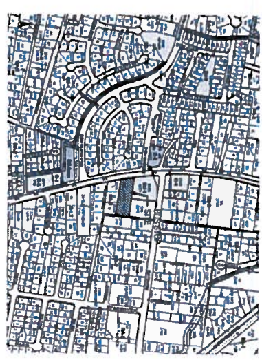
A3 VICINITY MAP 1" = 600'