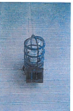
A1 BUILDING LIGHTING