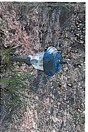
A1 PATH LIGHTING