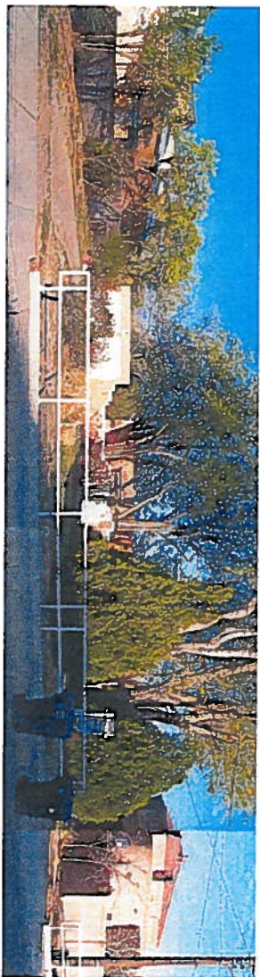
A1 PHOTO DOCUMENTATION - VIEW FROM RIO GRANDE