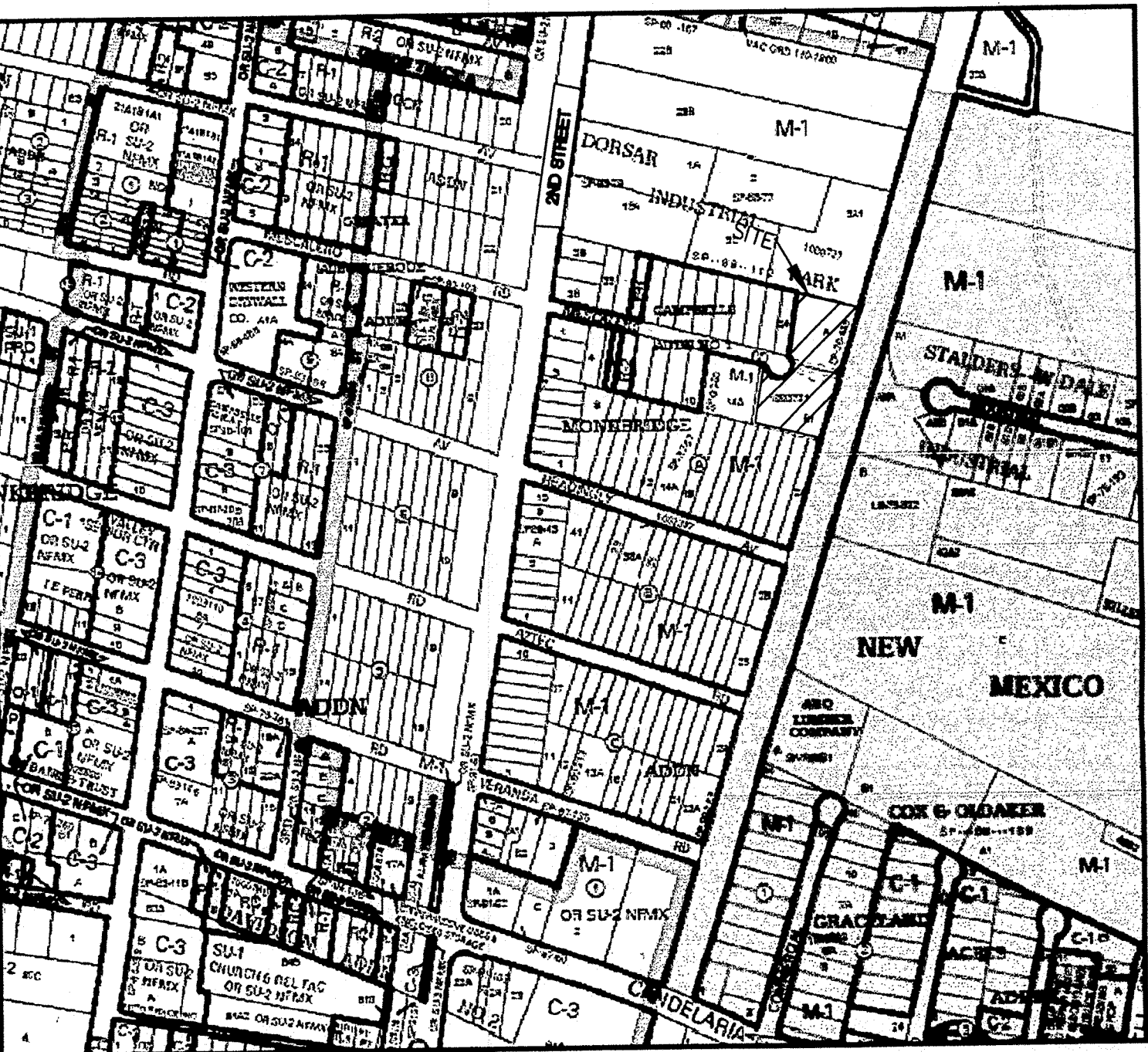
Exceptions 11-25 Vicinity Map G-15