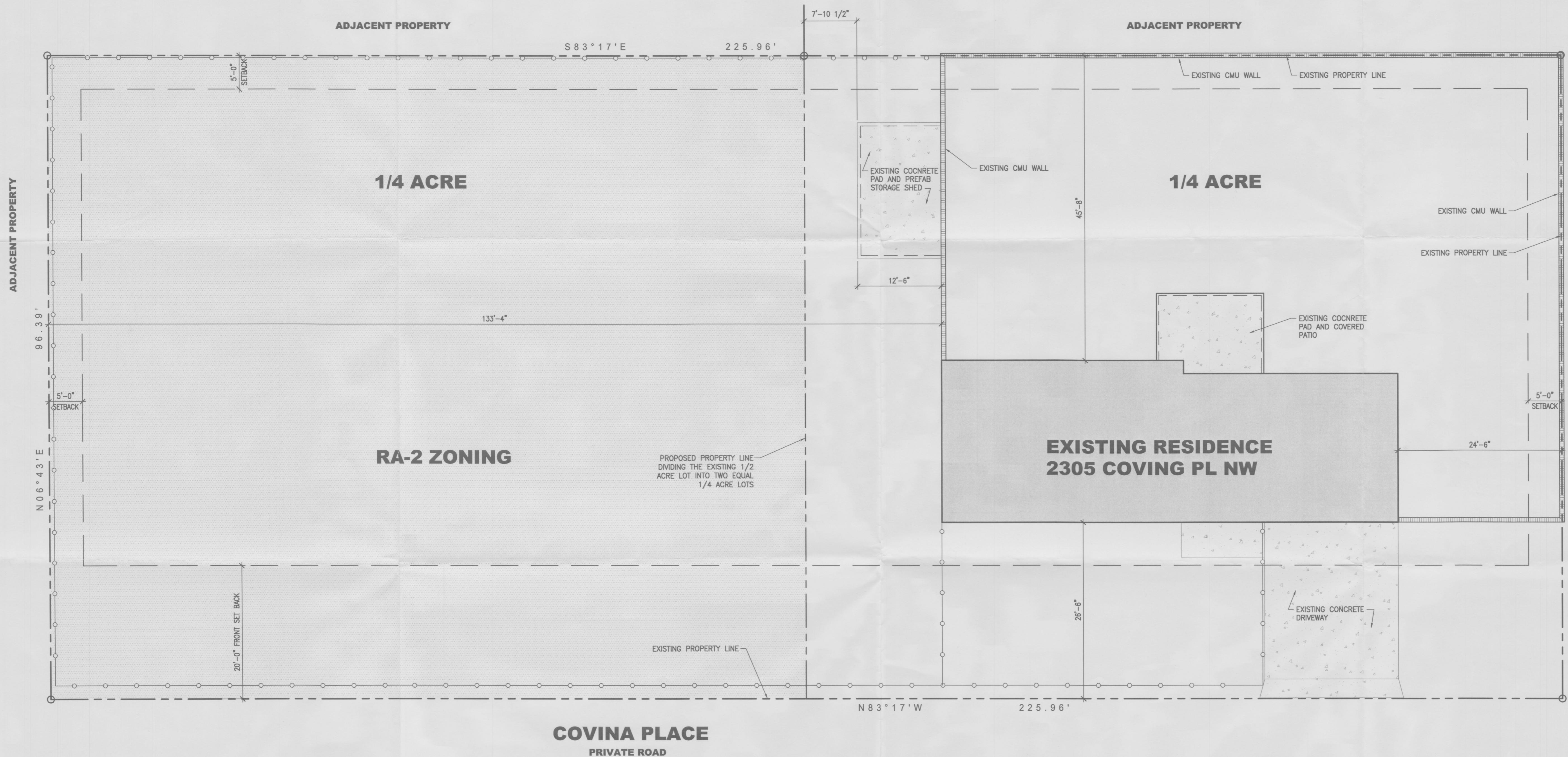
A1 SITE PLAN - PROPOSED PROPERTY LINE SCALE: 1/8"=1'-0"