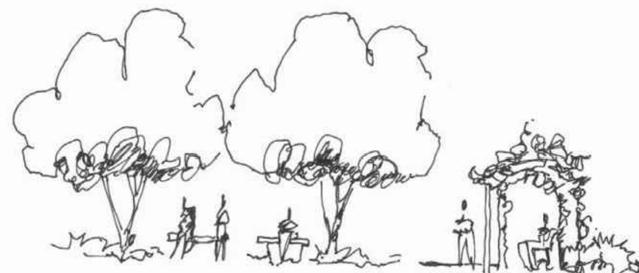
PEDESTRIAN AREAS - should include shade trees