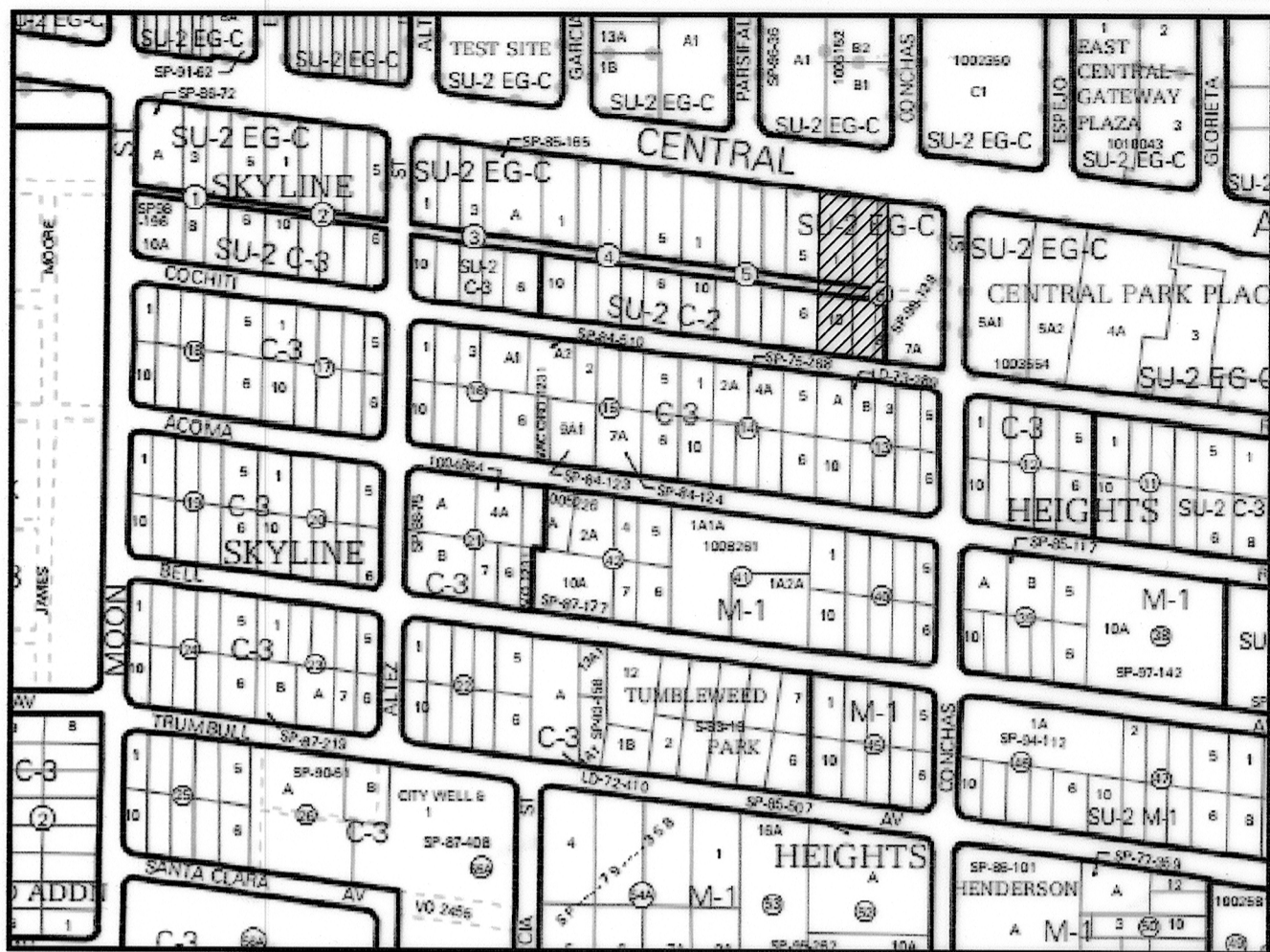
Zone Atlas Page L-20-Z