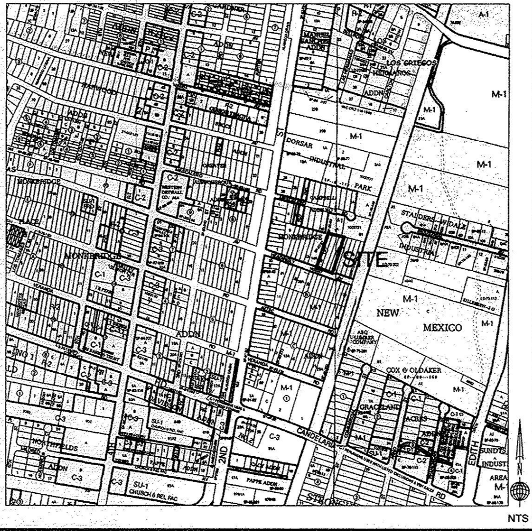
VICINITY MAP ZONE ATLAS PAGE G-15