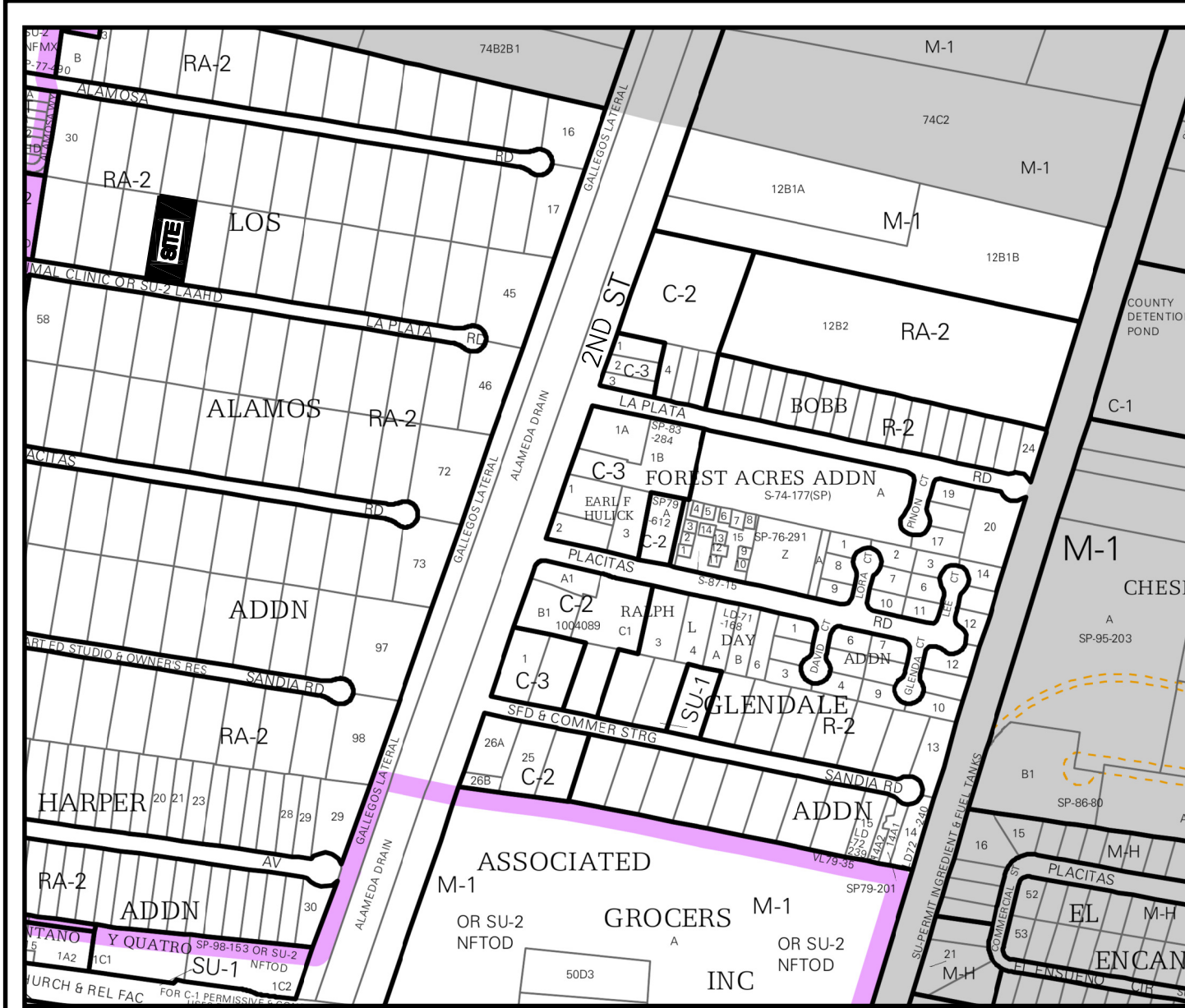
Vicinity Map - Zone Atlas F-15-Z n.t.s.