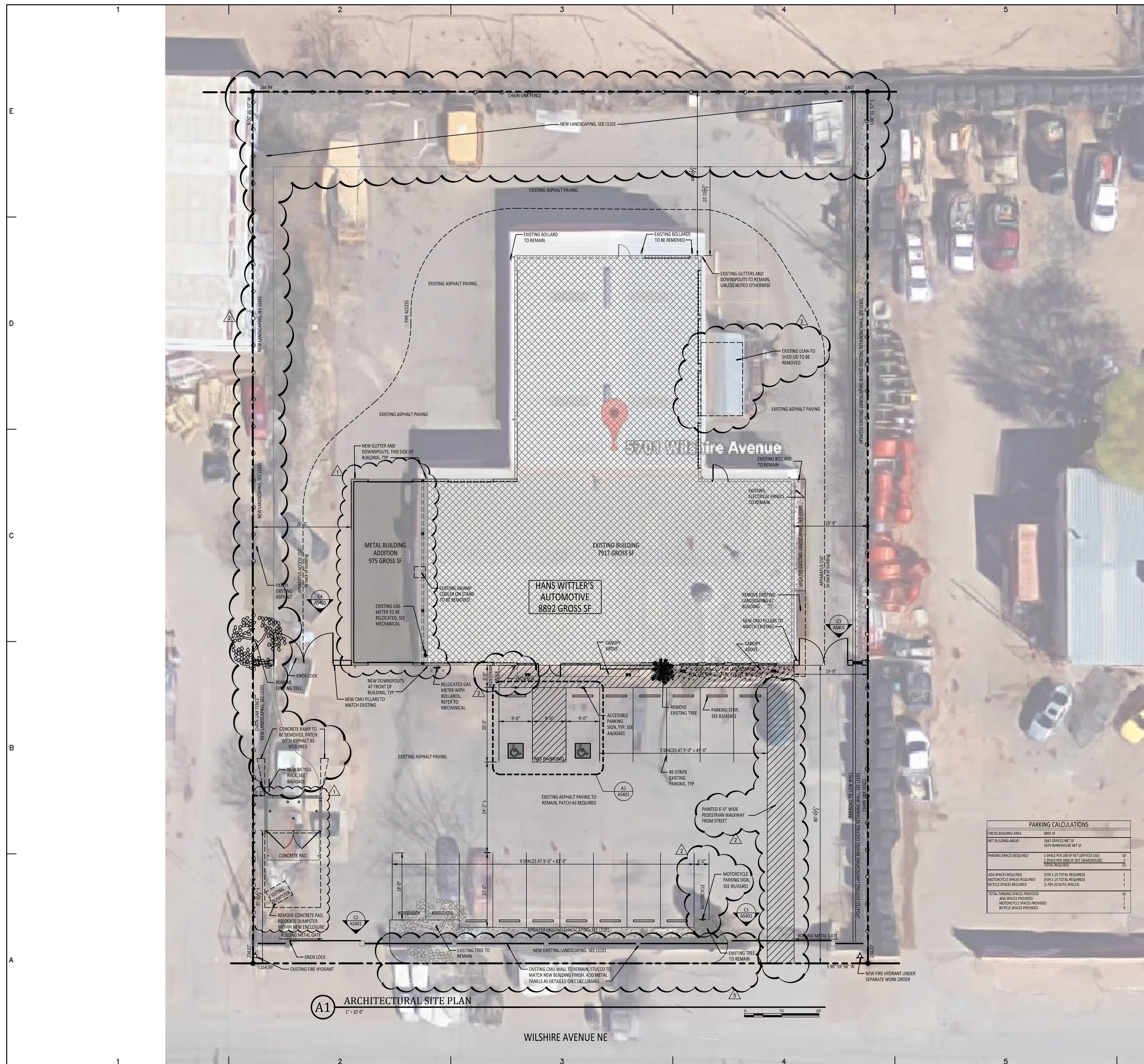
A1 ARCHITECTURAL SITE PLAN 1" = 10'-0"