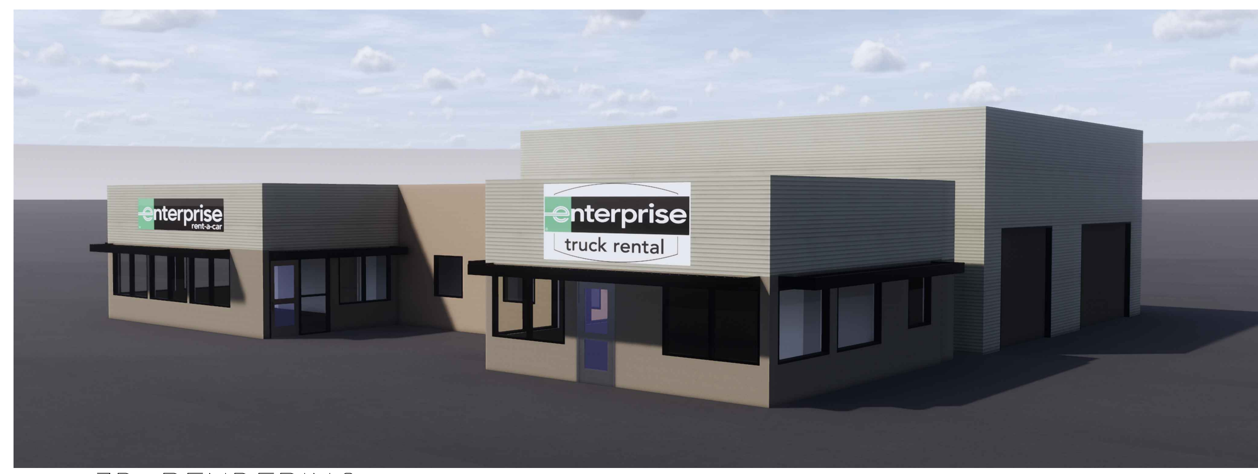
2 3D RENDERING SCALE: N. T. S.