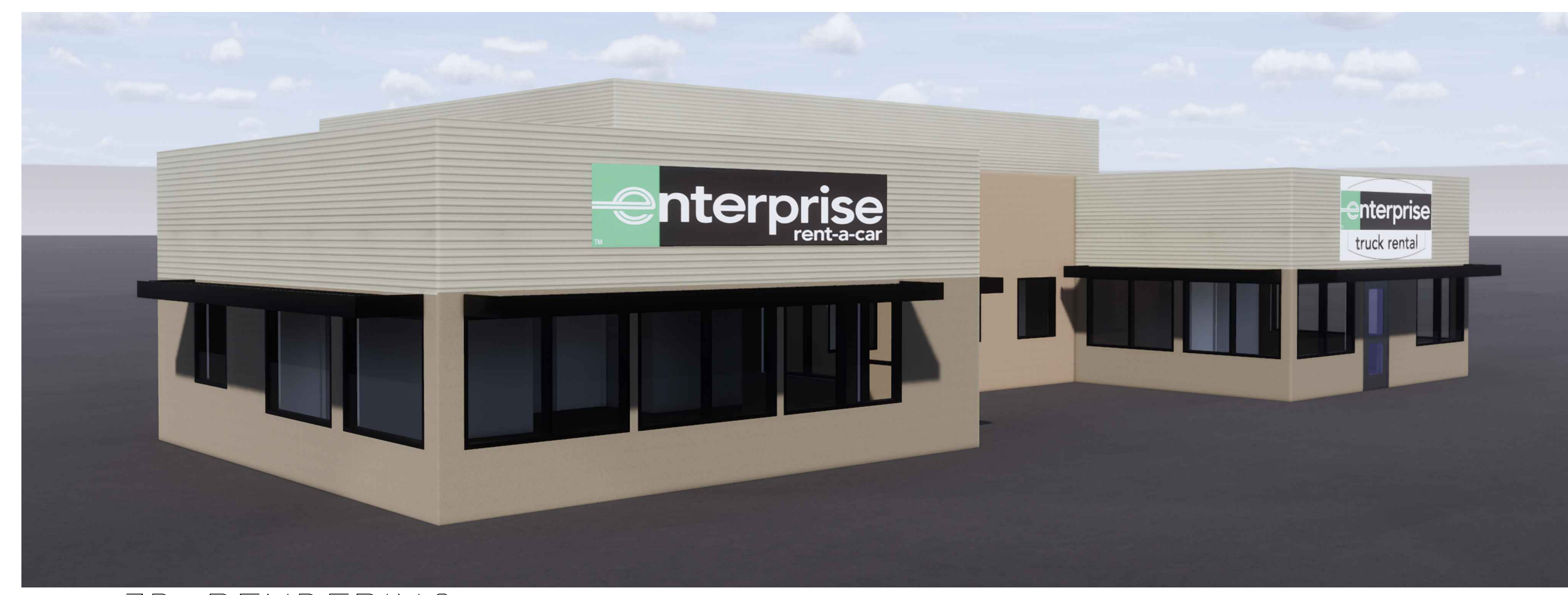
3 3D RENDERING SCALE: N. T. S.