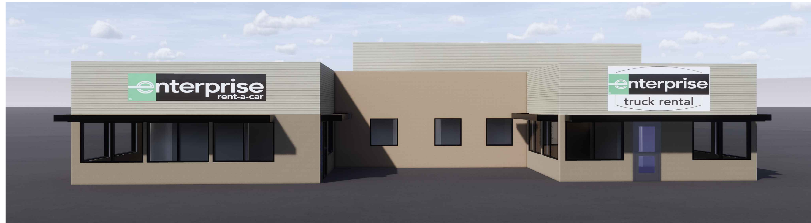
4 3D RENDERING SCALE: N. T. S.