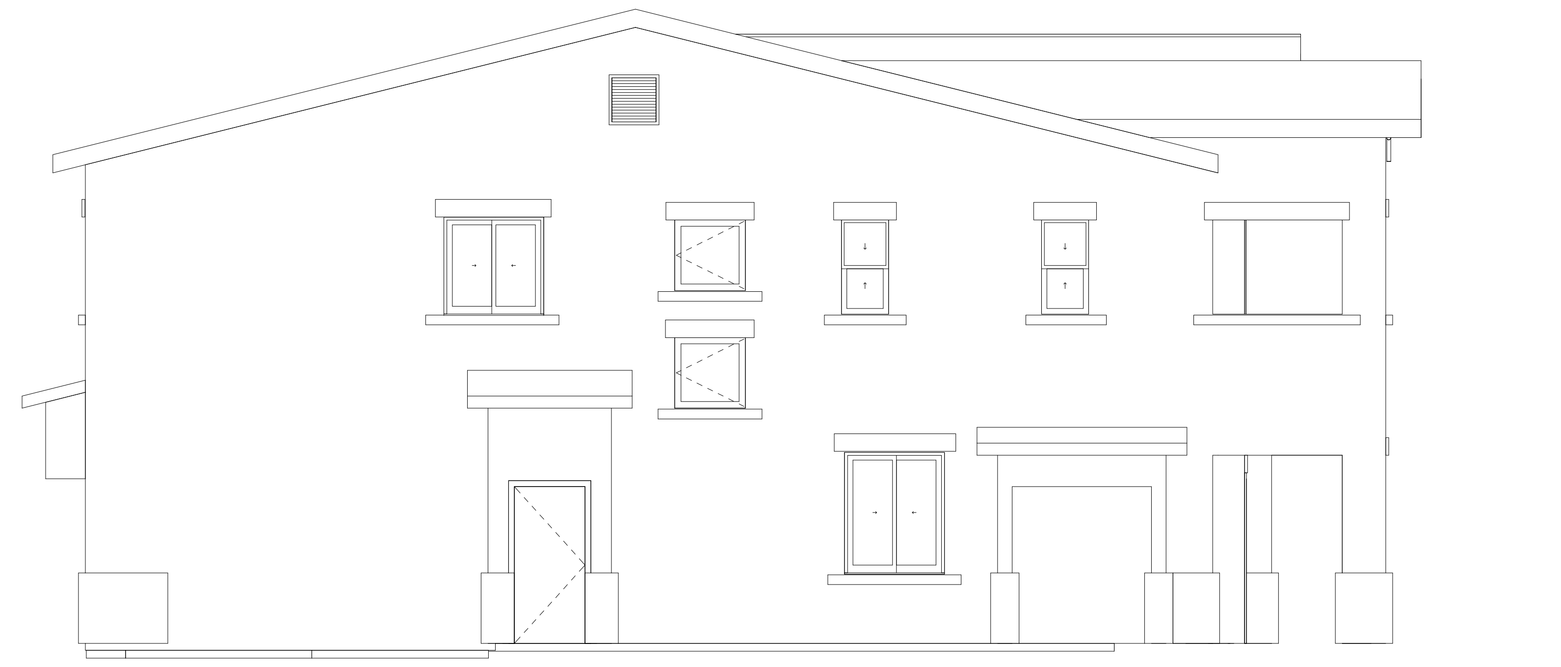
② West 1/4" = 1'-0"