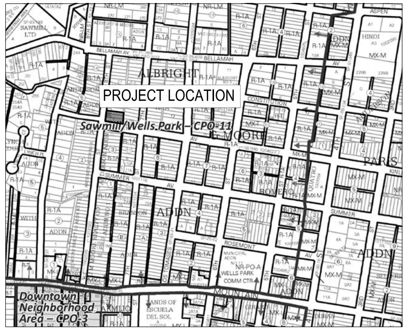
LOCATION MAP ZONE ATLAS MAP NO. J-14-Z