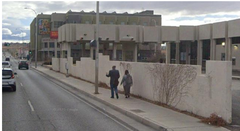
Figure 3: Wall along Lomas Blvd.

Further, there is an existing wall along Lomas Blvd that is approximately 150'-0" in length. This wall could not be easily or economically relocated. See figure 3, below/