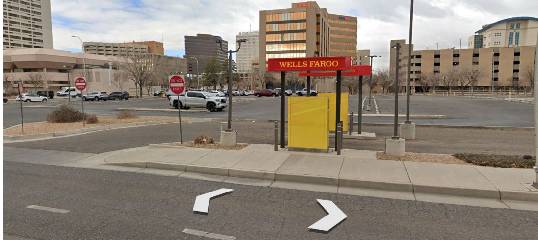
Figure 3: ATM Machine on subject site

3 rd street runs along the western frontage of the subject site. This area already has a 7'-0" sidewalk. The sidewalk is part of the established right-of-way conditions along this segment of 3 rd street. Relocating or reconstructing the sidewalk to meet current IDO standards would require removal of existing hardscape, and reconstruction in an area with limited available space. The subject site has utility connections to infrastructure along this western boundary. This utility infrastructure would have to be removed or relocated.