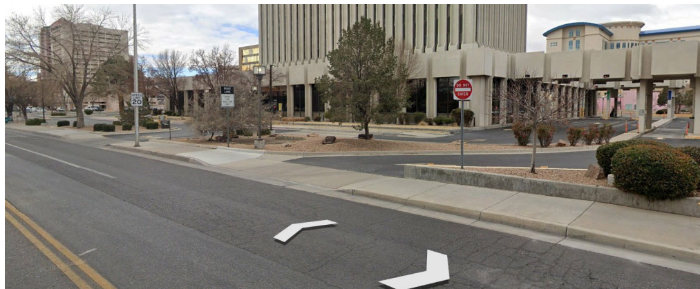
Figure 4: Existing established landscaping

There is existing landscaping along the entire length of the west frontage (3 rd Street) of the subject site. The landscaping includes shrubs and bushes and mature trees.