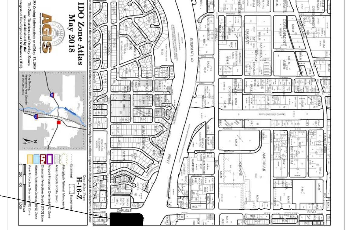
PROJECT LOCATION VICINITY MAP