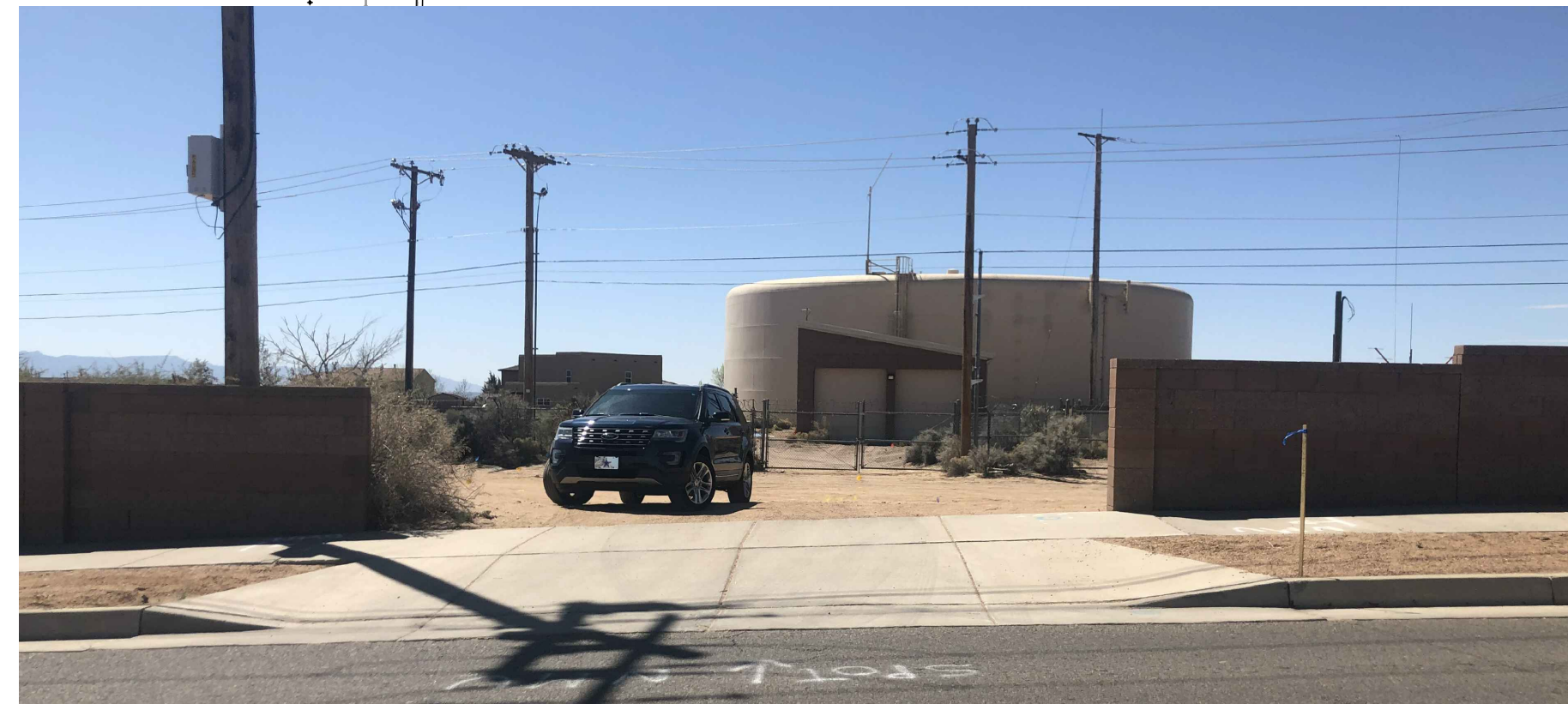
RESERVOIR NO. 3 ENTRANCE OFF BLACK ARROYO BLVD. NW PHOTO 1 NOT TO SCALE