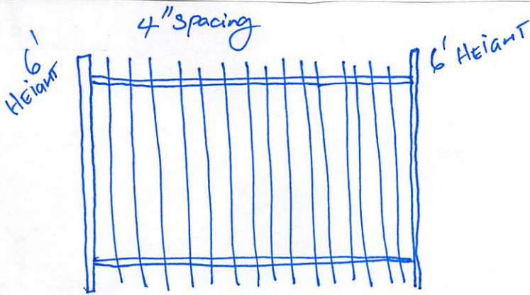
WROUGHT IRON FENCE ILLUSTRATION

ADD UNIDIRECTIONAL RAMP + SIGNAGE SIDEWALK 4' WIDE EXISTING WROUGHT IRON FENCE