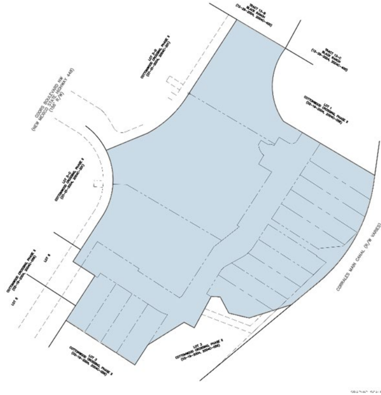
Figure 1: Subdivision Lot Boundaries