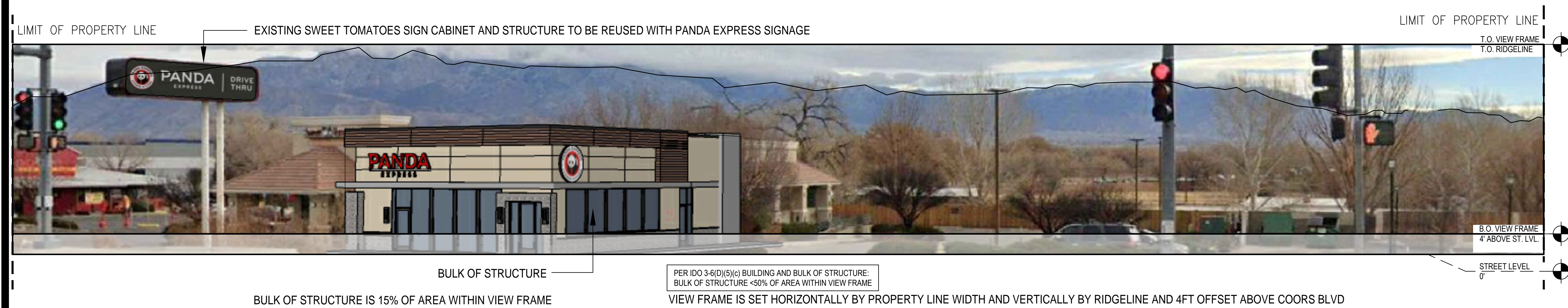
ANGLED VIEW FROM COORS BLVD.