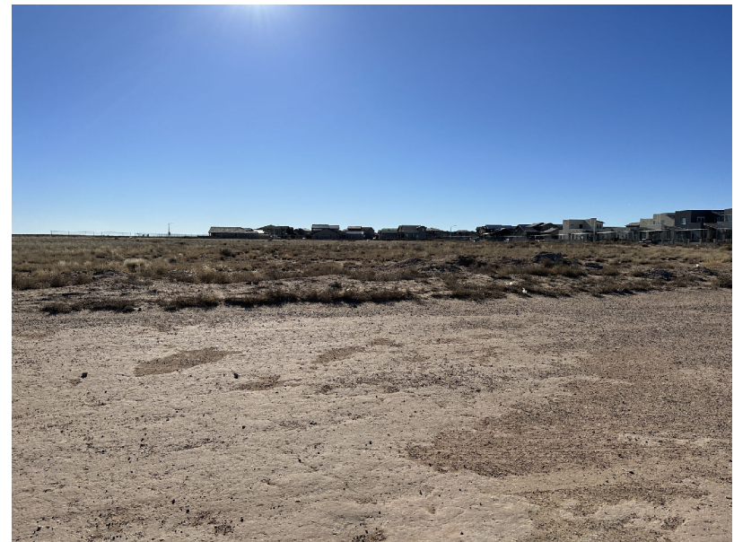
Site photos illustrate the lack of sensitive elements on the site.