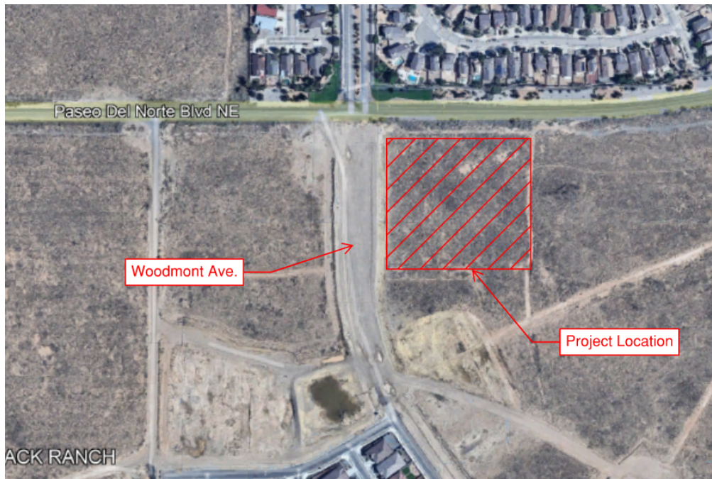
Figure 1 – Site Location:

The proposed self-storage facility requests a deviation from the standard parking to a total number of parking spaces to be 19 (including spaces allocated in loading dock areas). This will provide adequate parking spaces for customers utilizing this facility. Additionally, the minimum requirement to provide two (2) parking spaces and four (4) for bicycles should not apply as no one will be using these vehicles to haul an object to/from a storage facility.