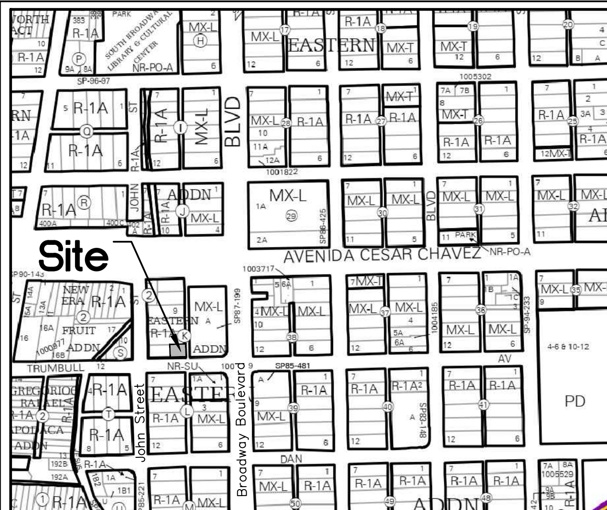
Vicinity Map - Zone Atlas L-14-Z