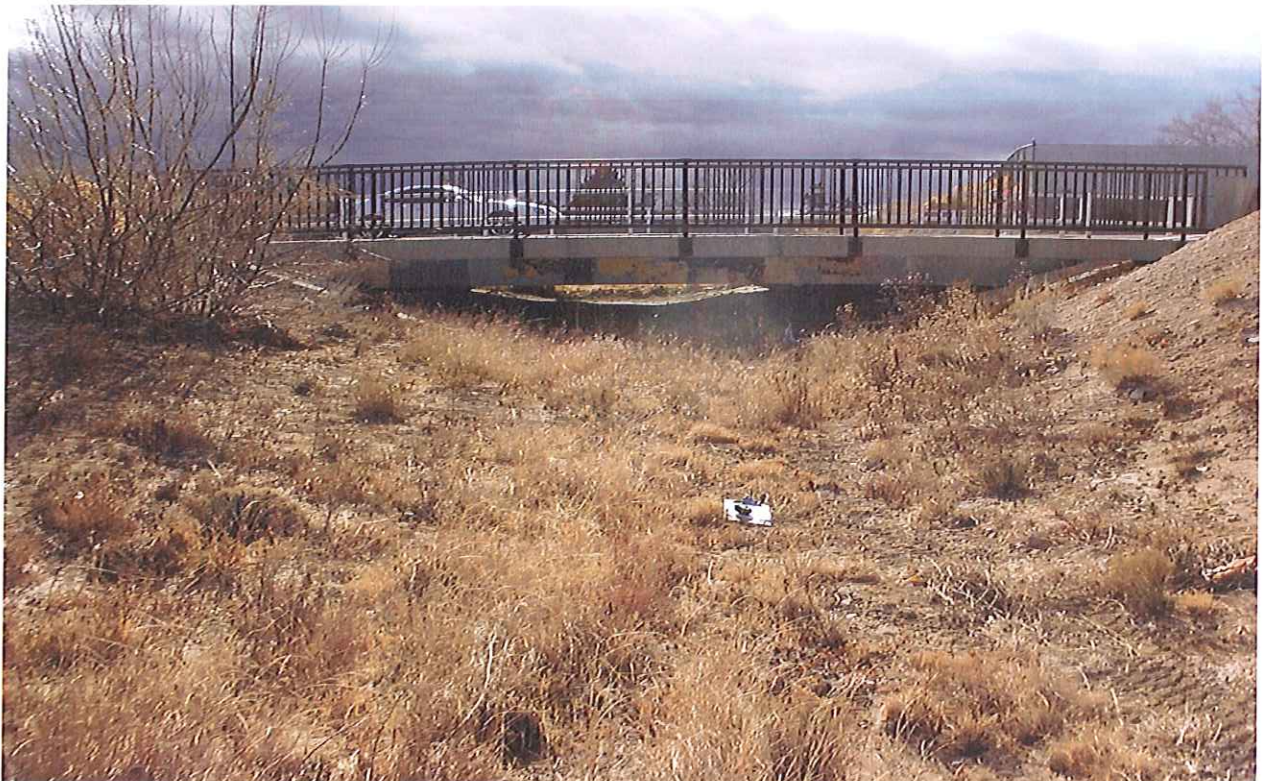
#18, Upstream end of Tarpon Ave. Bridge over Lisbon Channel. 30 ft. opening channel bottom, 32-inches to low chord, 6 -ft total depth from channel invert to top of road. Maximum available headwater depth = 6 ft.