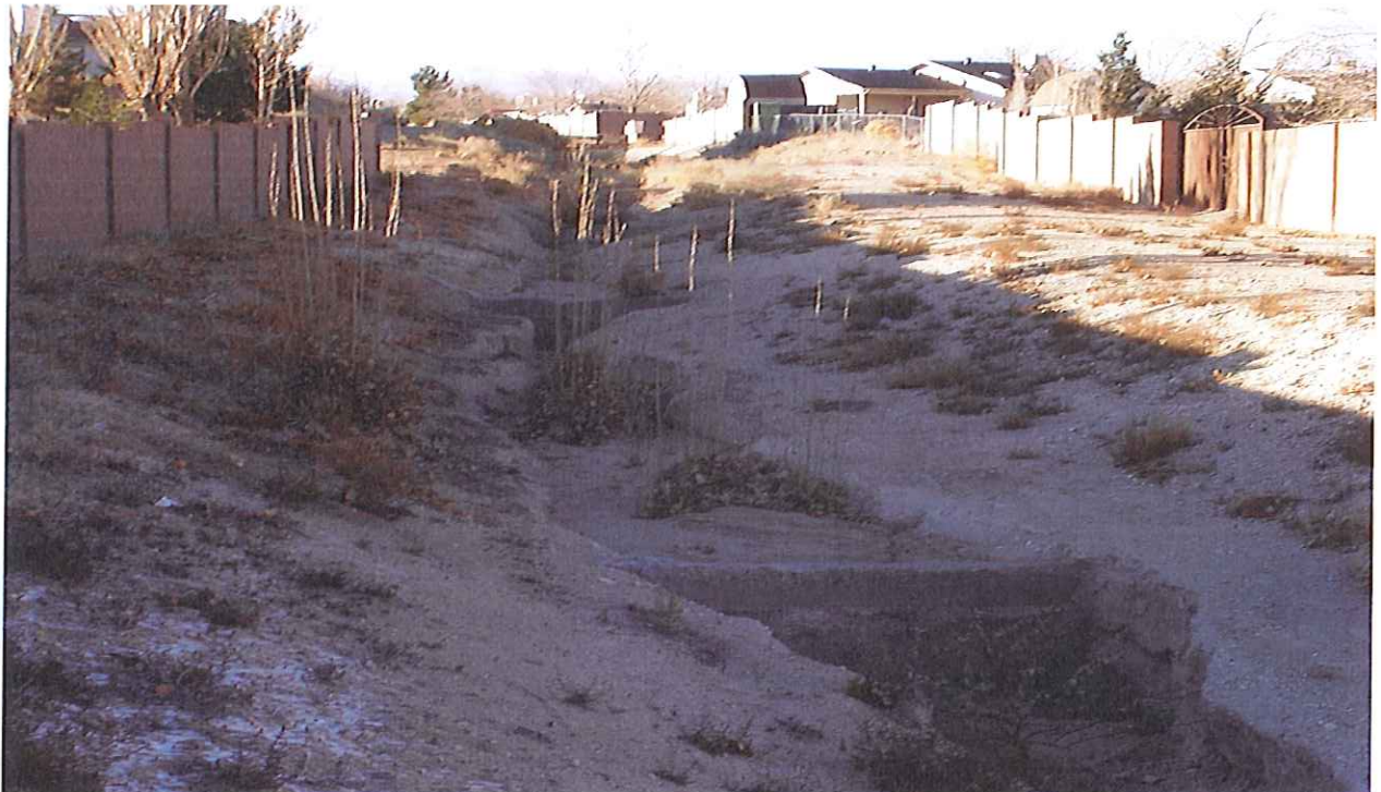
#34, Arkansas Channel looking upstream of Lisbon Ave. just north of Hood St. Typical channel 5 ft. bottom width, 1 ft. deep low flow channel, 4 ft depth from top of low bank to base of walls. 33 ft. top width.