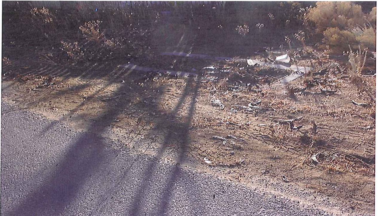
#32, Top of grate west side of Lisbon Ave. at unnamed arroyo - Basin 103.2.