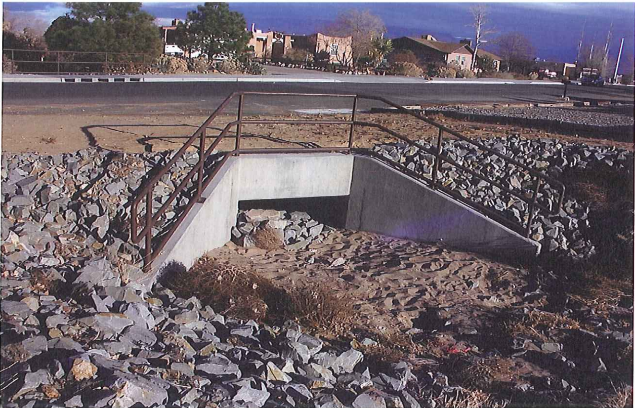
#29, Upstream side of Sunset Channel at Lisbon Rd. 1 – 2.5 ft. rise X 6 ft. span box culvert. Maximum available headwater depth = 5 ft. Sediment depth in culvert = 0 ft.