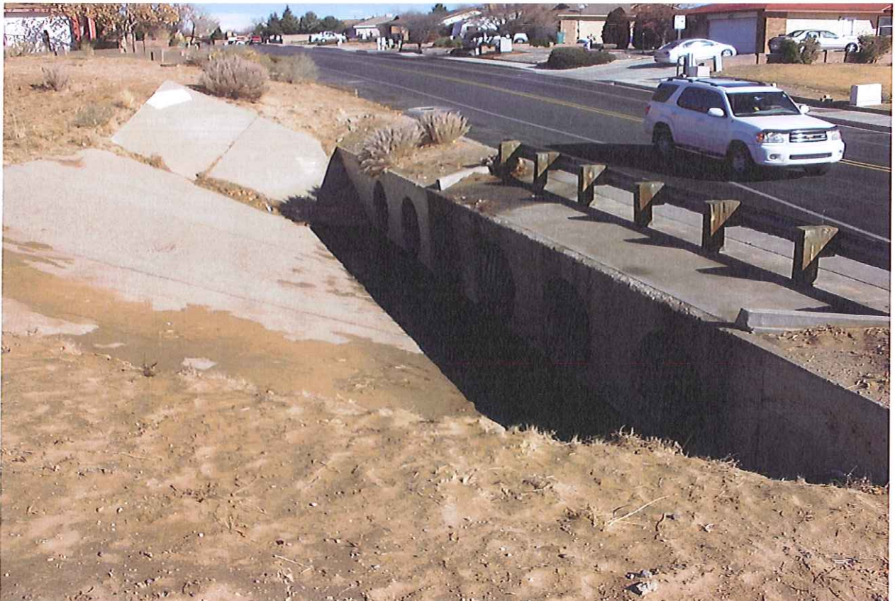
#8, Upstream end of Snead Channel at Nicklaus Drive. 6- 54-in. CMPs. 70-in. maximum available headwater to top of road. Sediment depth in culverts = 0 ft.