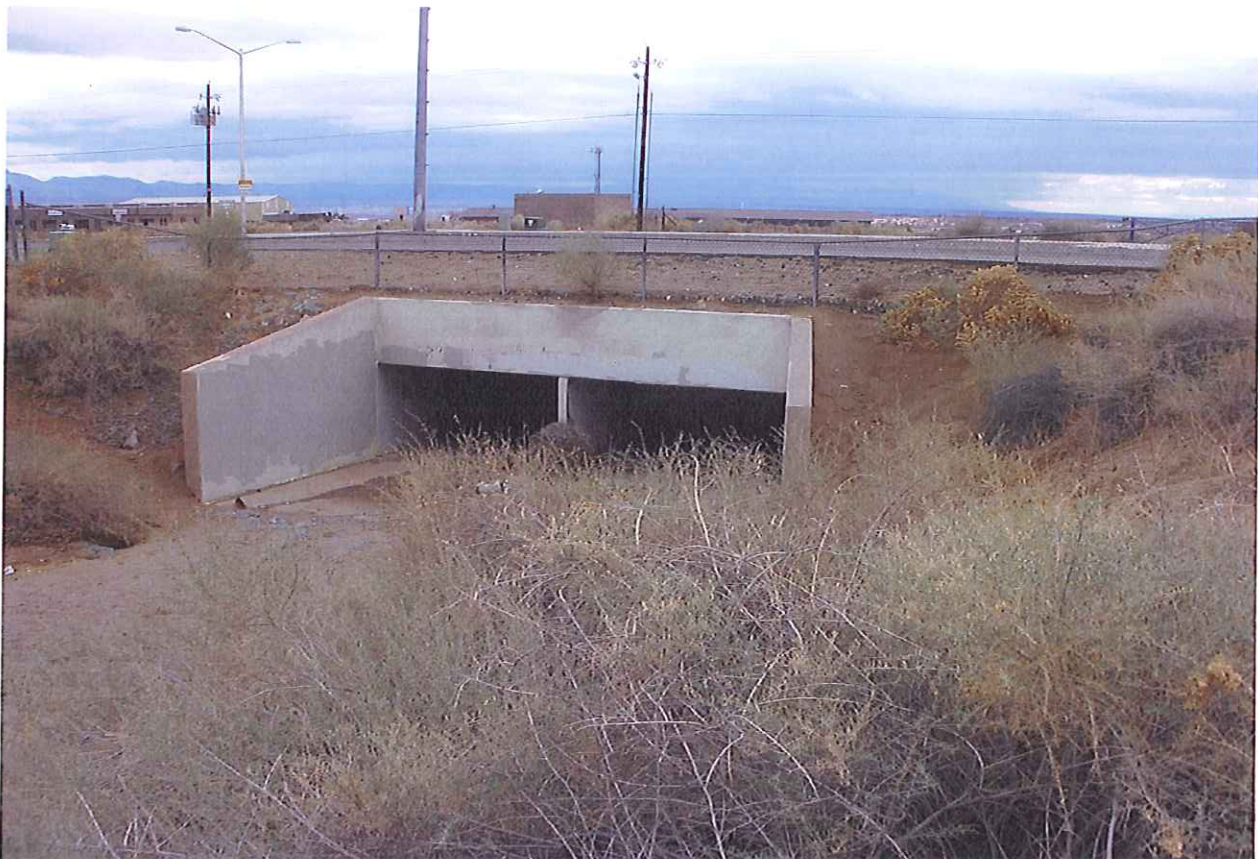
#16, Lisbon Channel box culverts upstream end at Southern Blvd. 2 – 6 ft. rise X 12-ft. span. Maximum available headwater to top of road = 13 ft. Sediment depth in culvert = 0 ft.