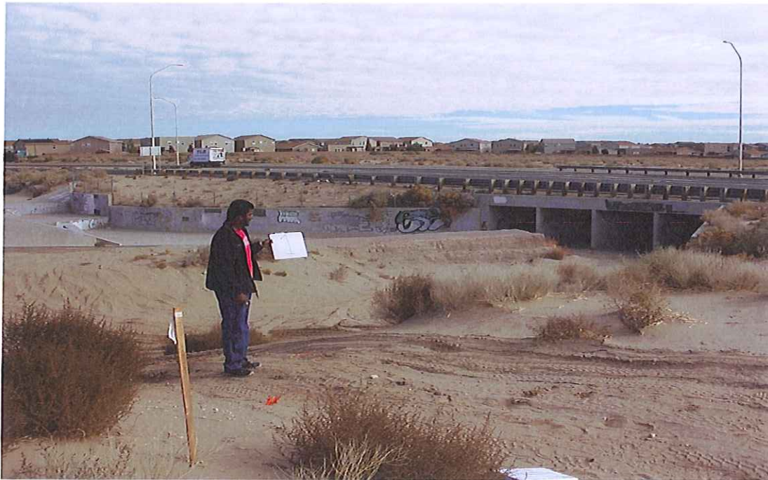
Photo 1 – (11-16-12) Black Arroyo West Branch – Unser Blvd. looking at upstream end of 4 – 10 span. x 8 ft. rise reinforced concrete box culverts (max. avail. headwater depth to top of headwall = 125 in. or 10.4 ft.). Unser Blvd. West Side Channel outfall at left of photo. (see photo 2).