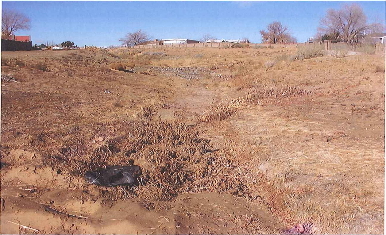
#9, Looking just upstream from Nicklaus Drive at Snead Channel. Typical 1-ft. low flow channel, 8 ft. total depth and about 60 ft. top width.