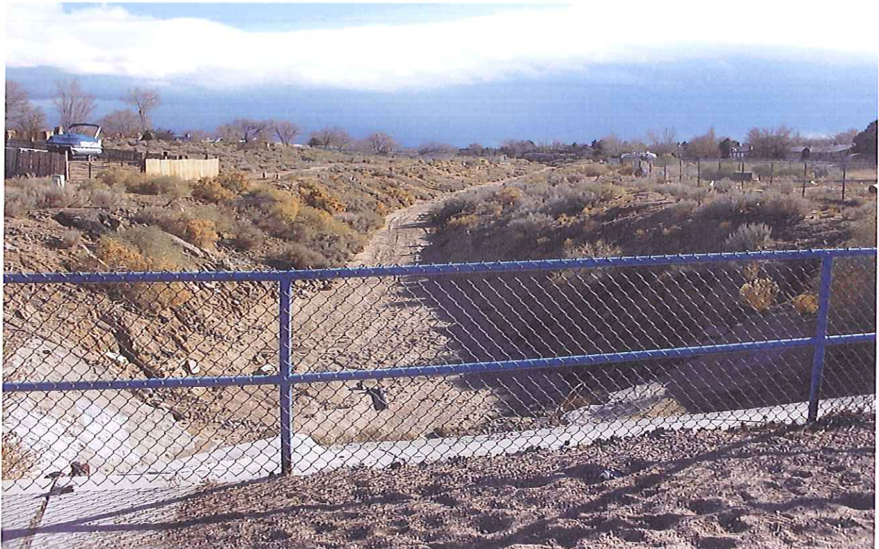
#22, Lisbon Channel looking downstream stream Tulip Rd. Similar shape to Photo near Bali Culdesac.