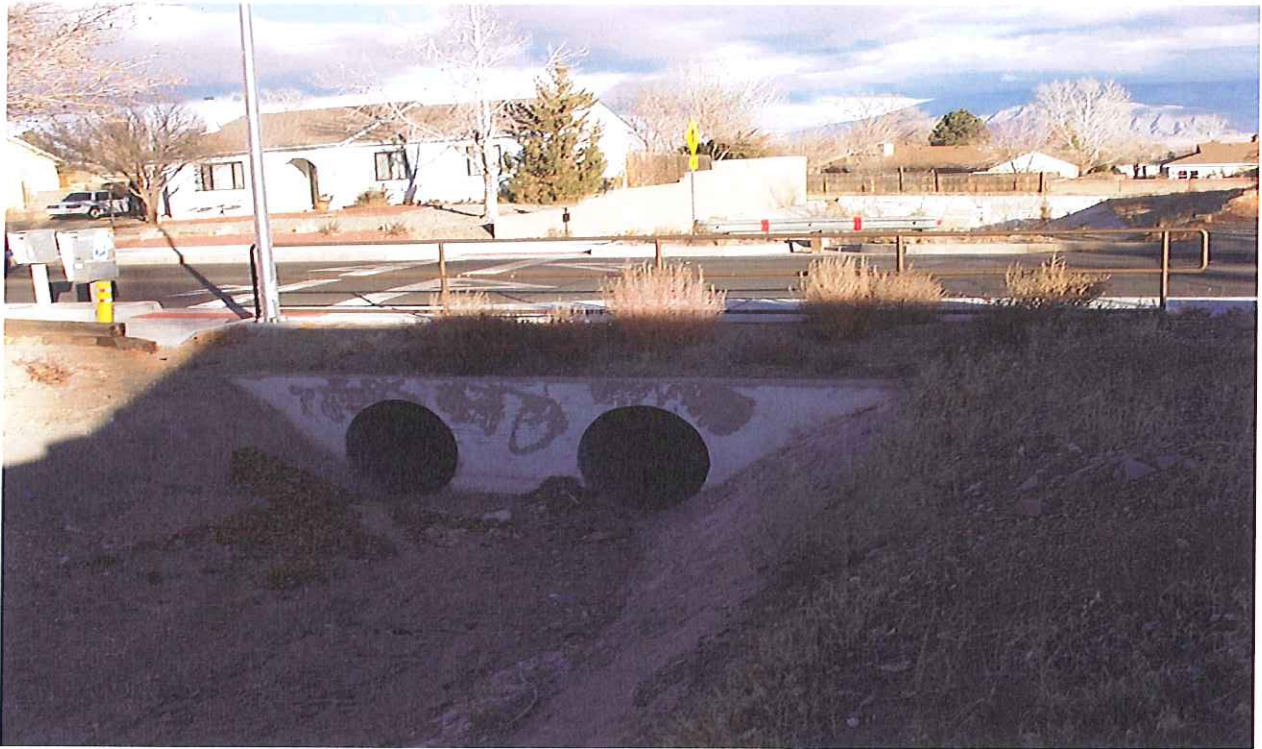
#33, Upstream end of Arkansas Channel at Lisbon Ave. 2 – 4 ft. CMPs. Maximum available headwater depth to top of road = 6 ft. Sediment depth in culverts = 0 ft.