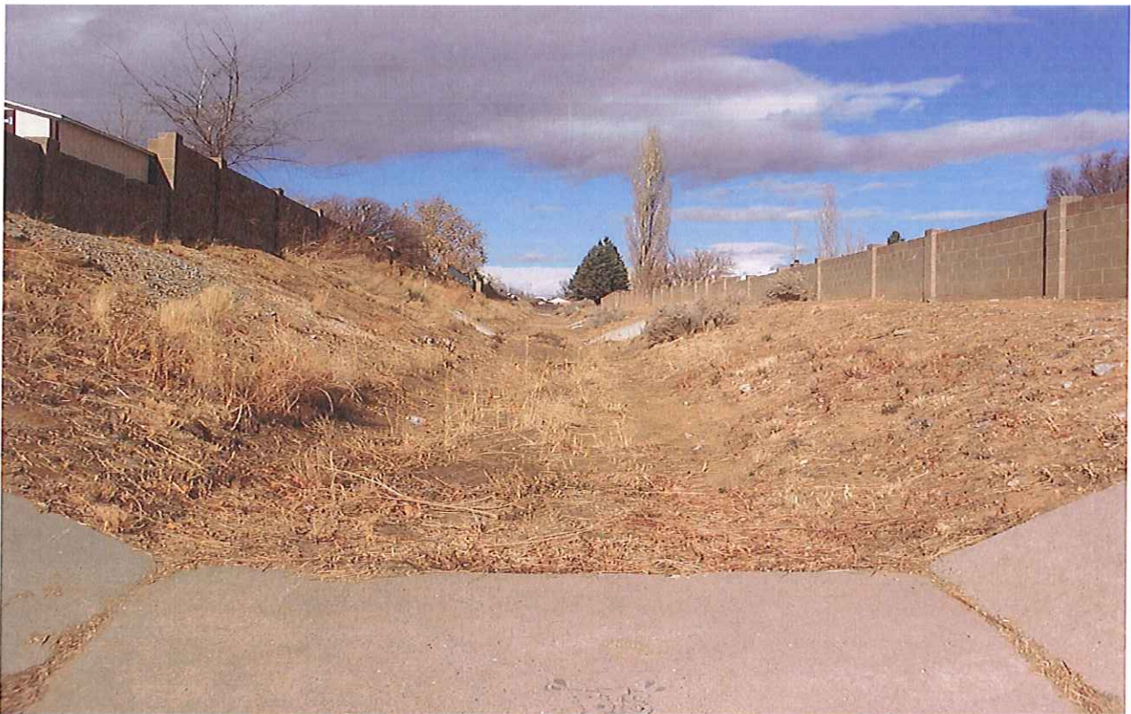
#12, Nicklaus Channel looking upstream from Fairway Rd. All soil with concrete grade control structures. Typical channel section 9 ft. bottom width, 41 ft. top width, 6 ft. deep. Side slopes – 1V:2.7 H