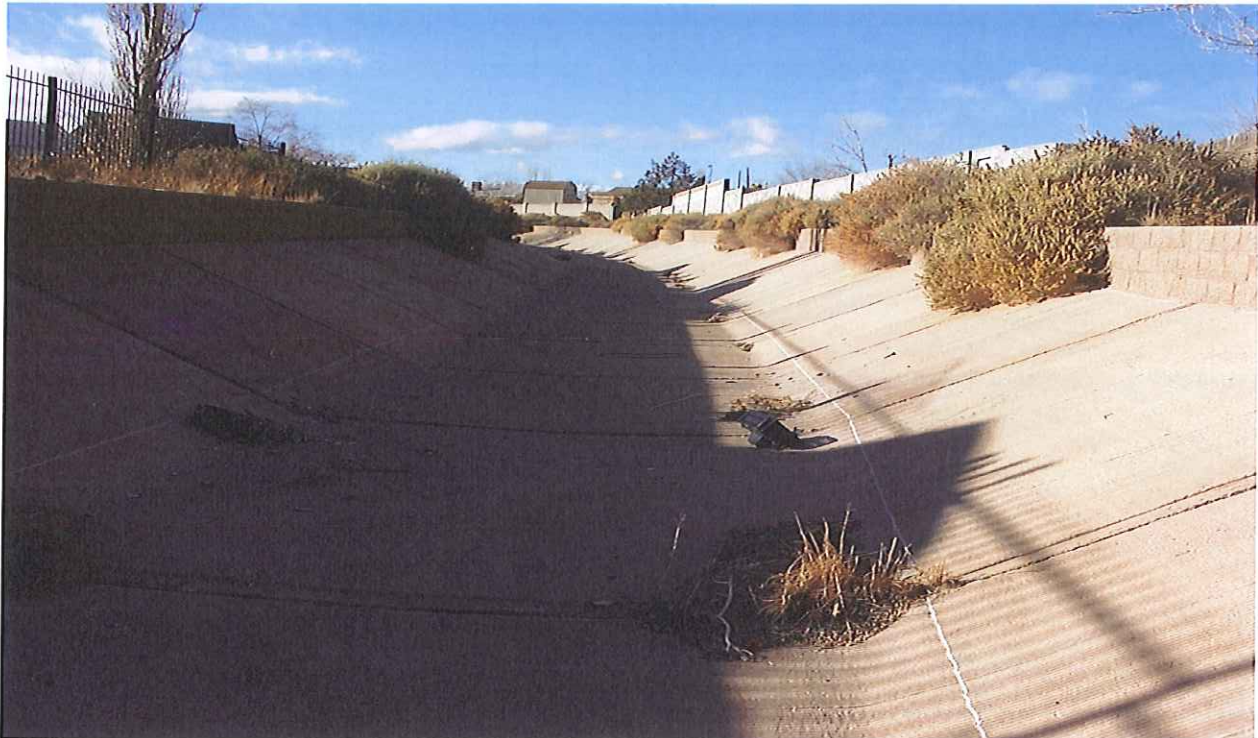
#25, Ivory Channel looking upstream from Spur Rd. Typical Channel has 10 ft. bottom width, 4 ft. deep to base of vertical walls, 2 ft. tall vertical walls 26 ft. width between vertical walls. NOTE – this concrete channel only extends from Spur Rd. to Spur Way. (just upstream from end of this photo).