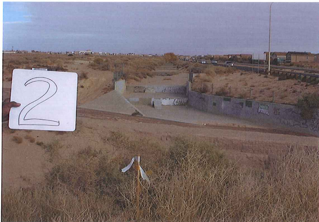
Photo 2 – (11-16-12) Unser Blvd. west side channel outfall at West Branch Black Arroyo (looking north).