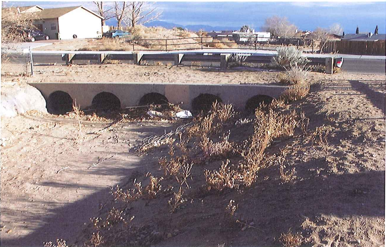
#27, Upstream side of Sugar Channel culverts at Lisbon Rd. 5- 36-in. CMPs. Maximum available headwater depth = 4 ft. Sediment depth in culverts = 0 ft.