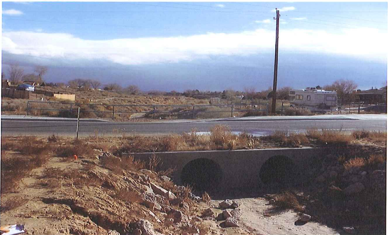
#20, Upstream side of Lisbon Channel at Tulip Rd. 2- 54-inch CMPS. Maximum available headwater depth = 6 ft. Sediment depth in culverts = 0 ft.