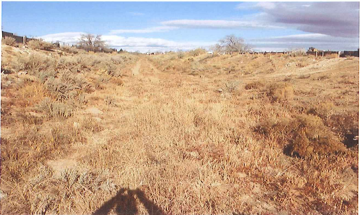
#19, Lisbon Channel looking upstream from Tarpon Ave. Typical 12 ft. bottom width, 48 ft. top width, 6 to 7 ft. typical depth, although upper channel has low points of about 4-ft.