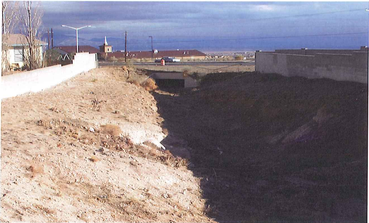
#23, Ivory Channel upstream end of culverts under Southern Blvd. 1 – 4 ft. rise X 10 ft. span box culvert. Maximum available headwater depth = 8 ft.. Sediment depth in culvert = 0 ft. Typical channel shape 7 ft. bottom width, 6 ft. deep, approximate 3 ft. rise from top of bank to base of wall elevation.