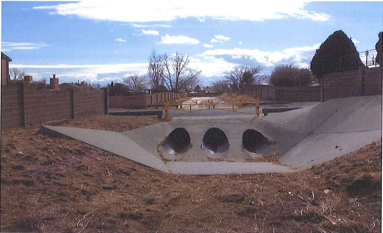
#11, Nicklaus Channel at Fairway Rd. 3 – 48-in. CMPs. Maximum available headwater depth = 68-inches. Sediment depth in culverts = 0 ft.