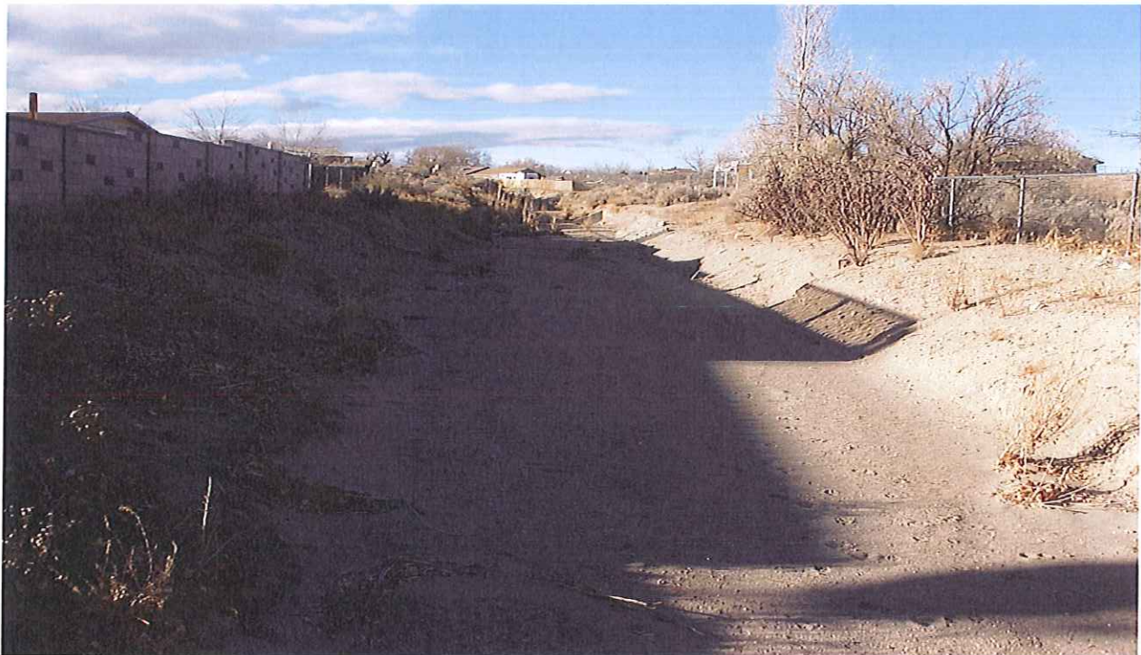
#28, Sugar Channel looking upstream from Lisbon Rd. Typical channel bottom width = 10 ft. 3 to 4 ft. deep.