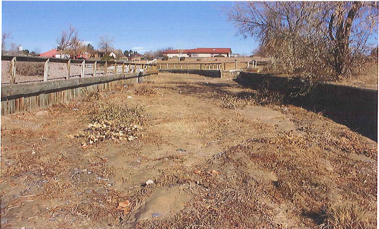
#6, Rectangular Nicklaus Channel looking upstream from Southern Blvd. Vertical wall depth - 40-inches.