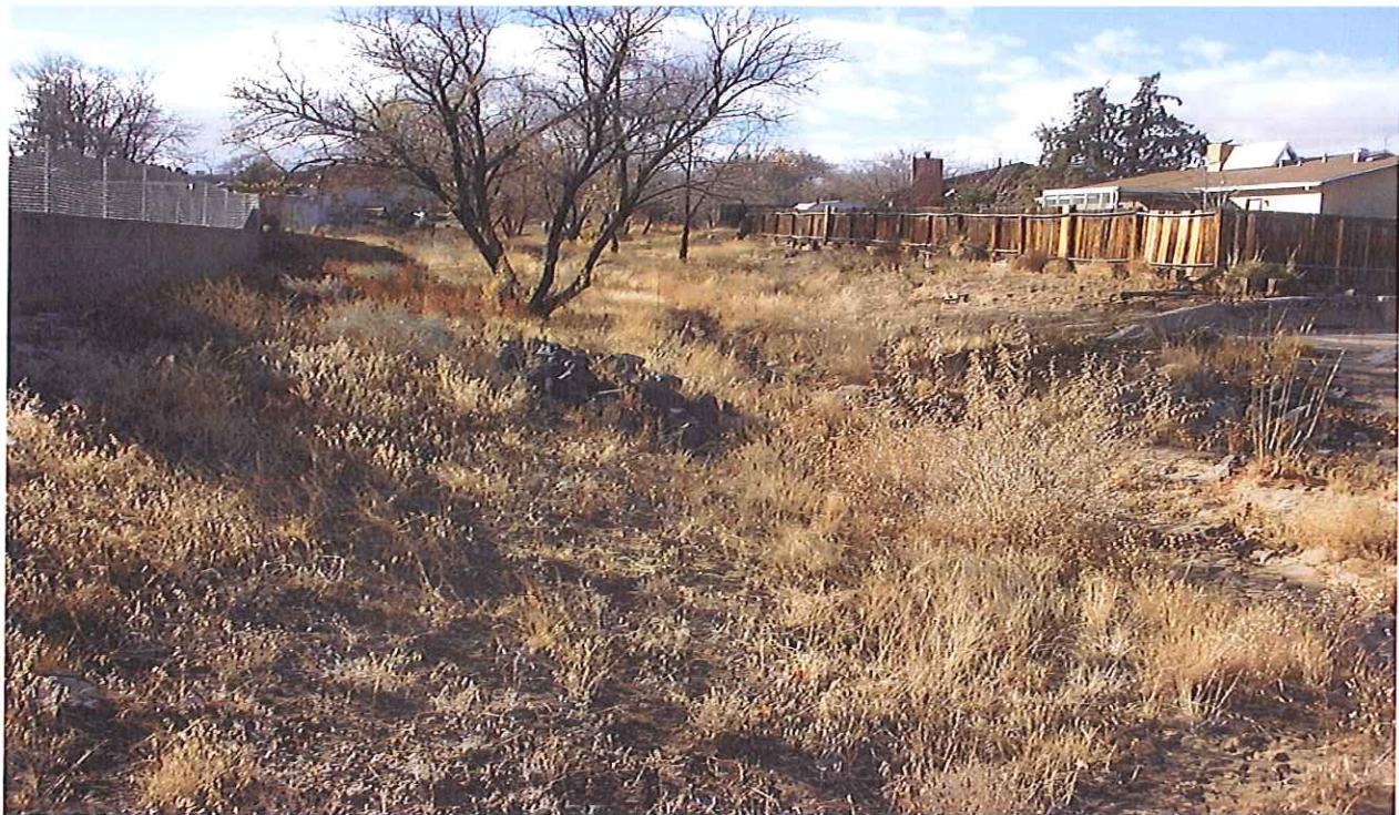
#26, Ivory Channel looking upstream from Spur Way. Typical channel, 3 ft. bottom width, 18-in. tall low flow banks, 5 ft. total channel depth, 58 ft. top width. Very mild side slopes.