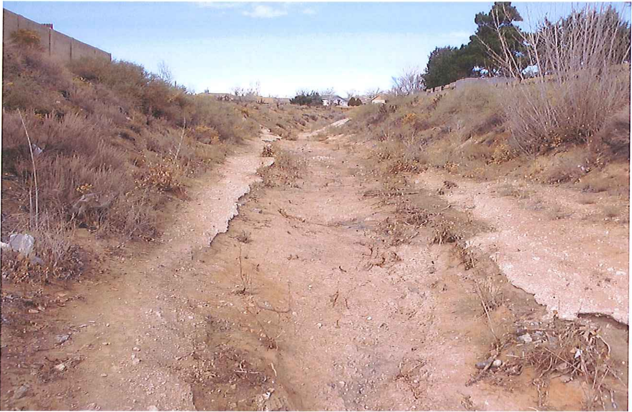
#17, Lisbon Channel looking upstream from Baltic Culdesac. Typical Channel = 12 ft. bottom width, 14 ft. deep.