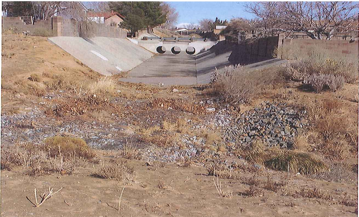
#10, Looking upstream at Nicklaus Channel (Casper Rd) confluence with Snead Channel. 3- 48-in. CMPs. 5.5 ft. maximum available headwater to top of road. Sediment depth in culverts = 0 ft.