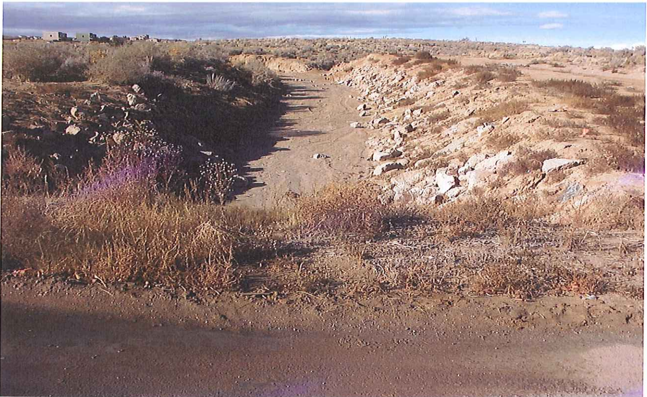
#21, Lisbon Arroyo looking upstream from Tulip Rd.