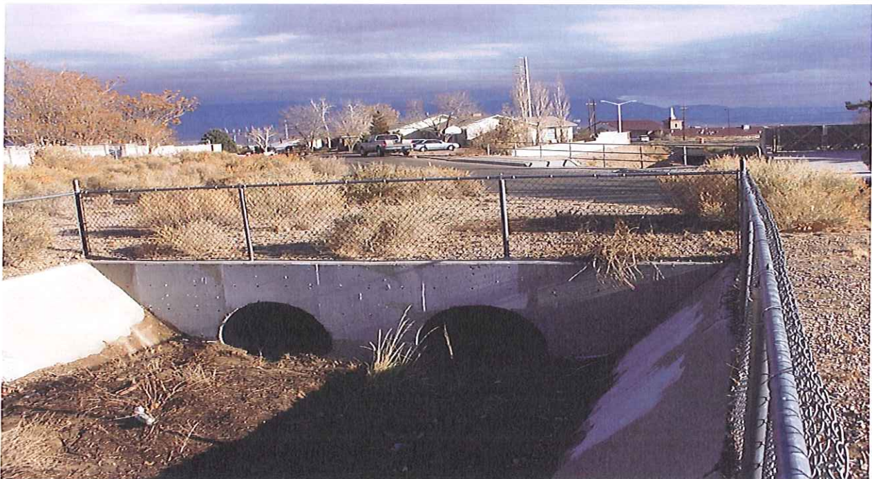
#24 Ivory Channel looking at upstream side of Spur Rd. 2 – 36-in. rise X 56-in. span CMPs. Maximum available headwater depth to top of road = 61-inches. Sediment depth in culverts = 0 ft.