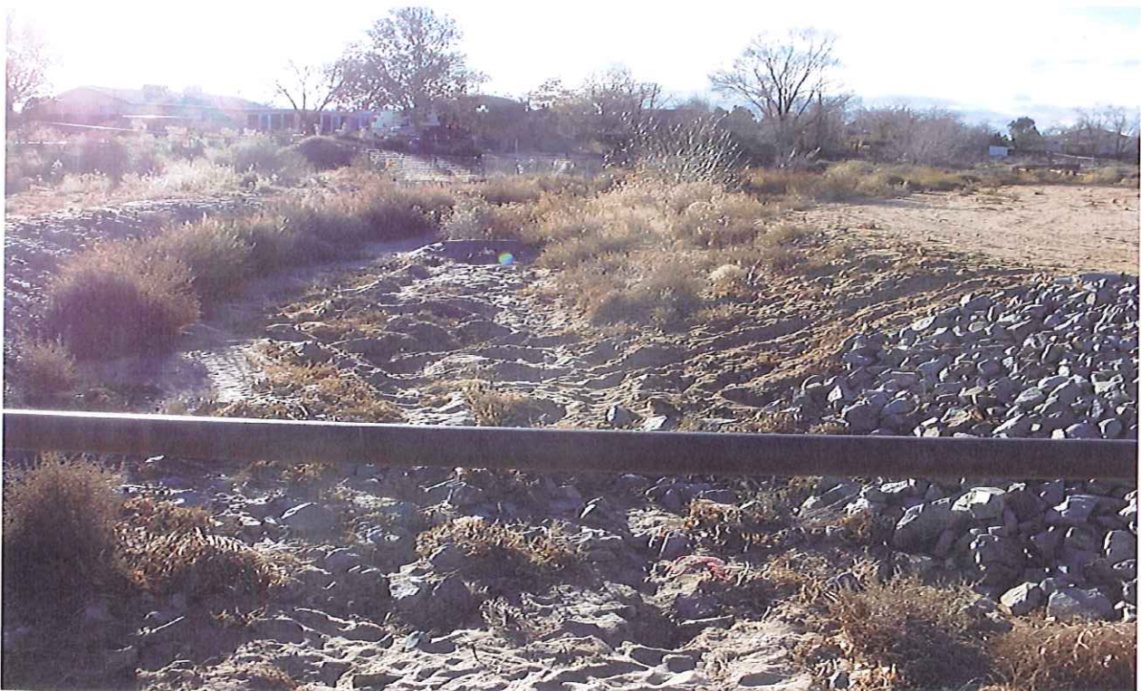
#30, Sunset Channel looking upstream from Lisbon Ave. Typical channel 10 ft. bottom width, 2 ft. deep main channel depth with 1V:2H side slopes, 3 ft. total depth limits of overbanks.