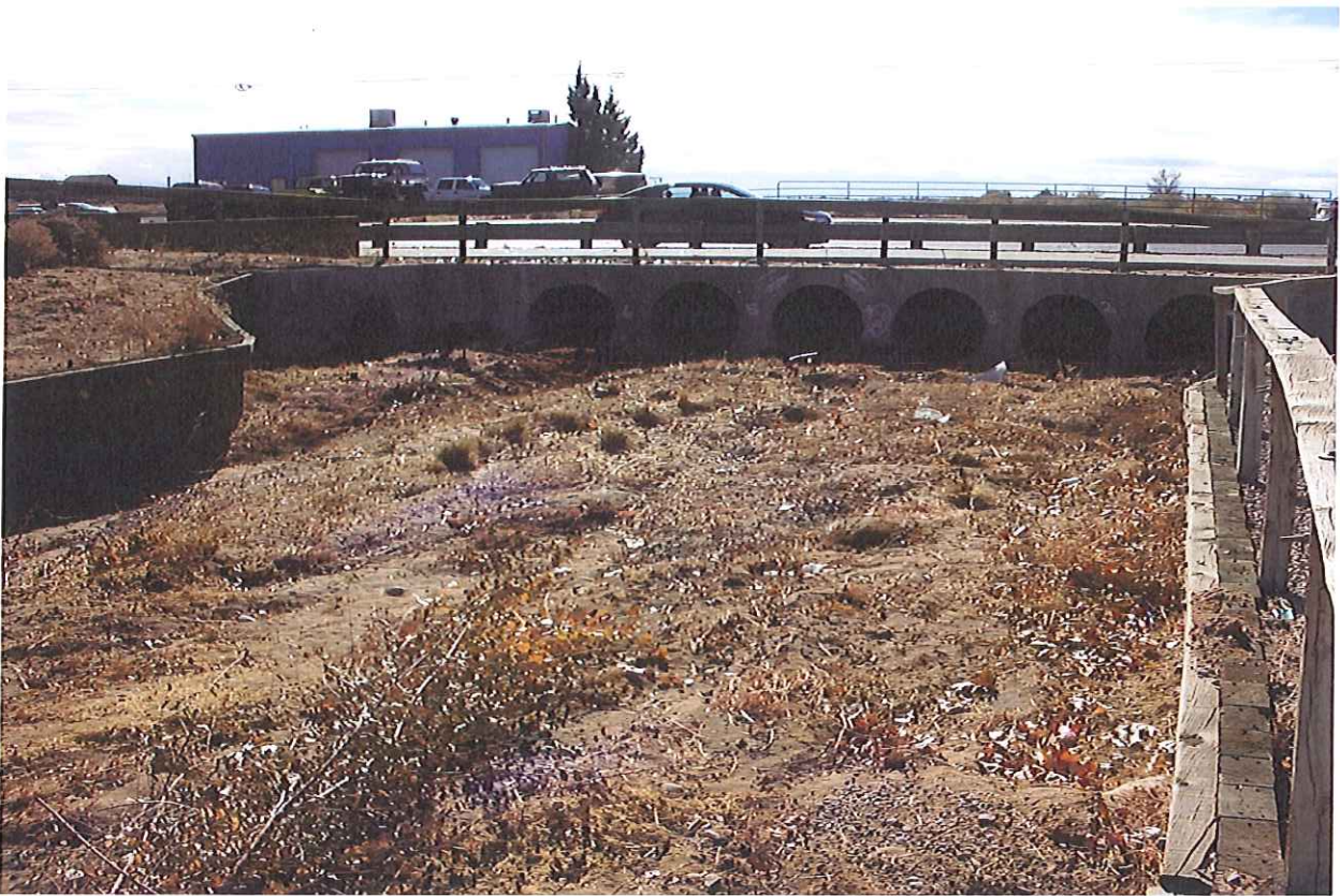
#5, Upstream end of Nicklaus Channel culverts under Southern Blvd. 6- 54-in. CMPs. 6 ft. maximum available headwater to top of road. Sediment depth in culverts = 0 ft.