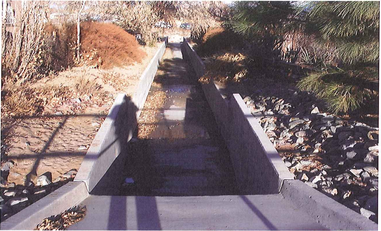
#31, Sunset Channel looking downstream from Lisbon Ave.