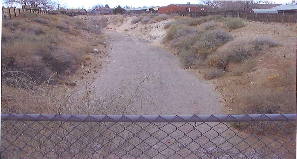
#15, Lisbon Channel looking upstream from Southern Blvd. Typical Channel has 16 ft. bottom width and 13 ft. depth.