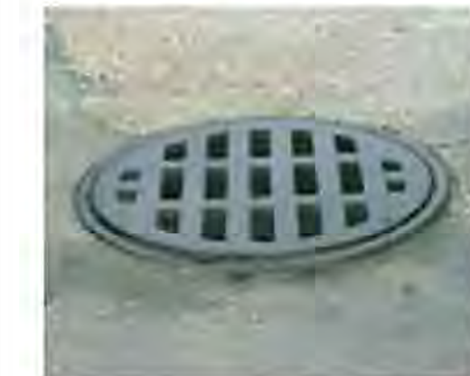
STANDARD CONSTRUCTION DETAIL WEIGHTED FILTER SOCK

1. Remove sediment, debris, ice and snow from the inlet grate surface and surrounding area. 2. Verify fit by placing filter over inlet grate to ensure that Inlet Filter extends at least one inch beyond the front and both curb ends. The overlap slows water