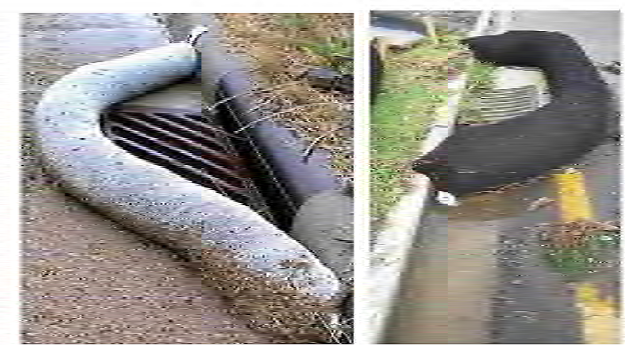
Curb Storm Inlet Protection with Wattles

Inspections Plus Inc. Erosion Control Plan Standard Details