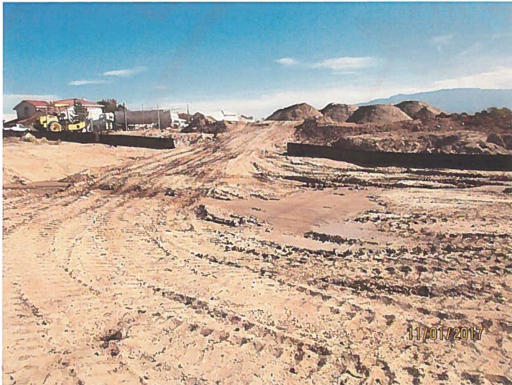
Disturbed area with no BMP.