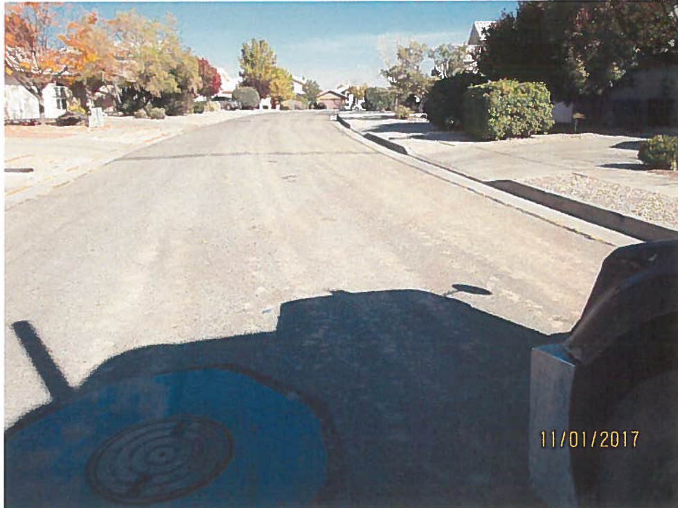
Track-out on Sierra Morena St extends up to the intersection with Rabadi Castle Ave.