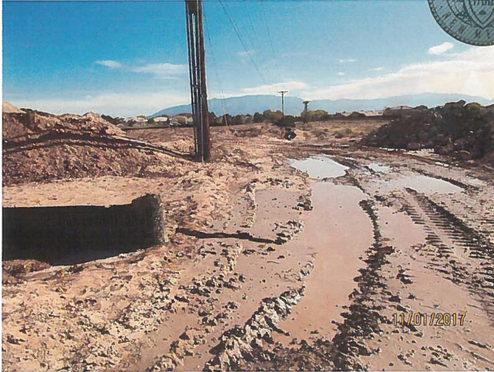
Disturbed area with no BMP.