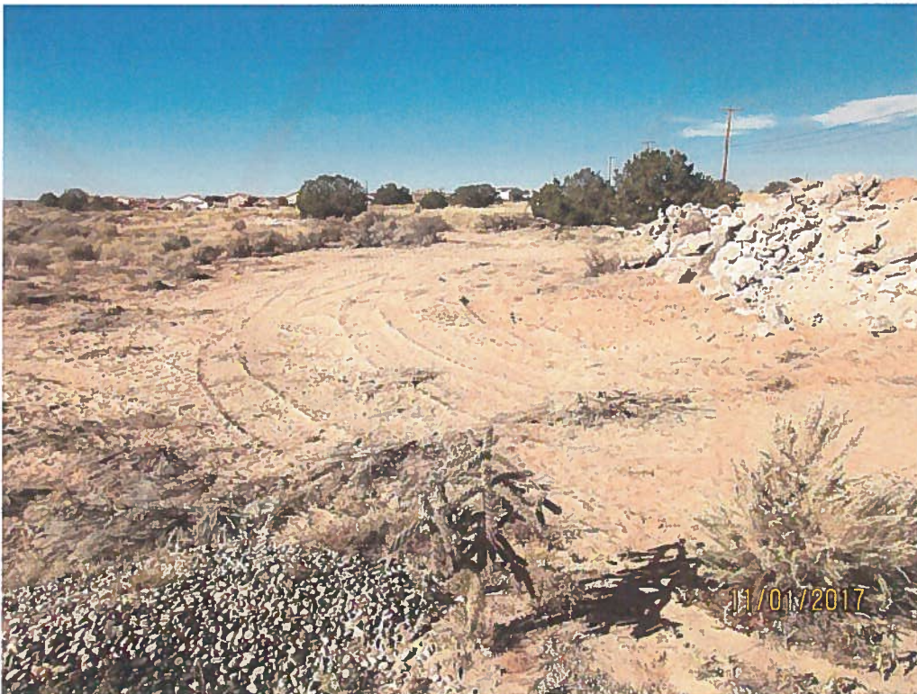
Disturbed area with no BMP.