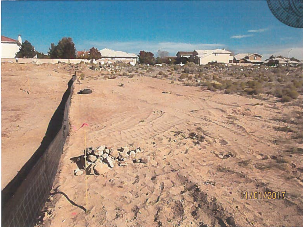
Disturbed area with no BMP.