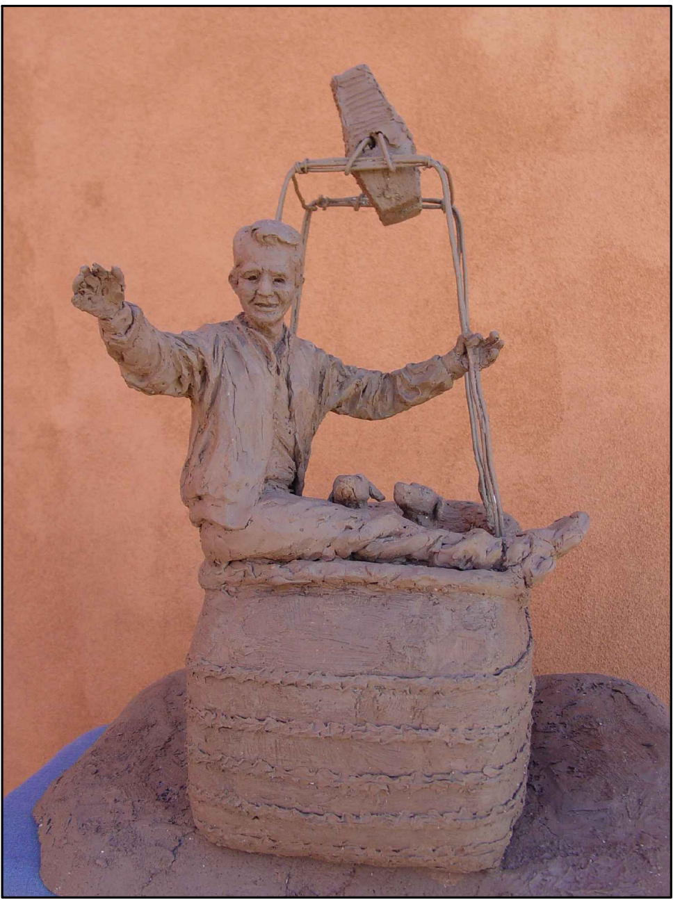
THE SID CUTTER SCULPTURE, AS ILLUSTRATED ABOVE, IS APPROXIMATELY 5' SQUARE AT THE BASE, AND APPROXIMATELY 12' TALL. THE SCULPTURE IS BEING CREATED BY LOCAL ARTIST, SONNY RIVERA, IN COLLABORATION WITH THE CUTTER FAMILY. AS SUCH, REFINEMENTS TO THE SCULPTURE AND SETTING MAY OCCUR DURING THE CREATIVE PROCESS.