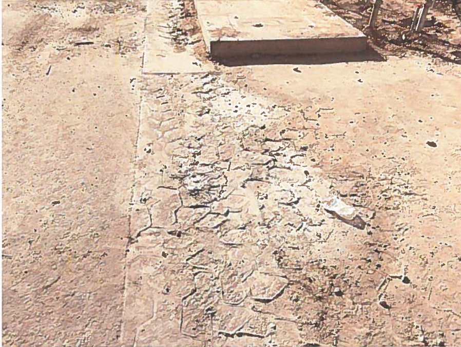
Wash-out in on-site valley gutter.