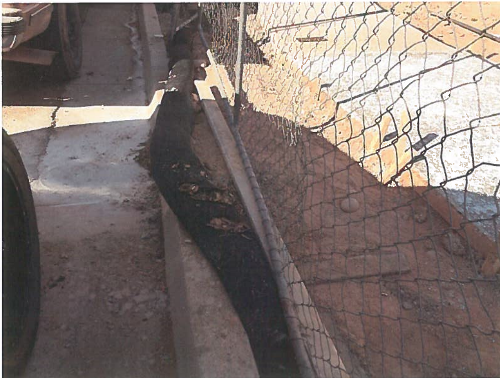
Concrete wash-out in City Street.