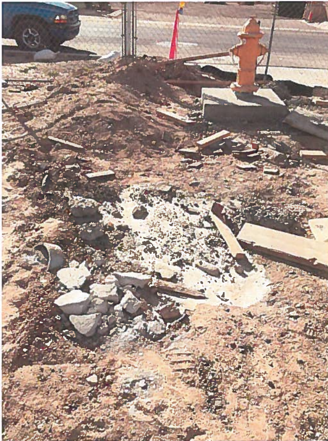
One of numerous wash-outs through-out the site.