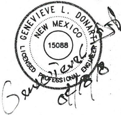
Genevieve L Donart, NMPE No. 15088

relying on the record document are advised to obtain independent verification of its accuracy before using it for any other purpose.