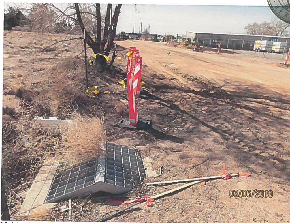
Neither of the inlets at the north end of the project had inlet protection.