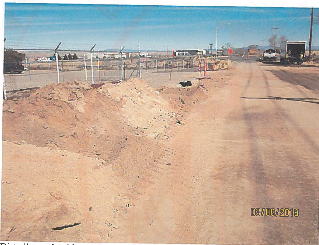
Dirt pile on shoulder of San Pedro, No BMPs. Drains to unprotected inlet.