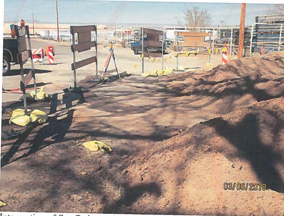
Intersection of San Pedro and Glendale.