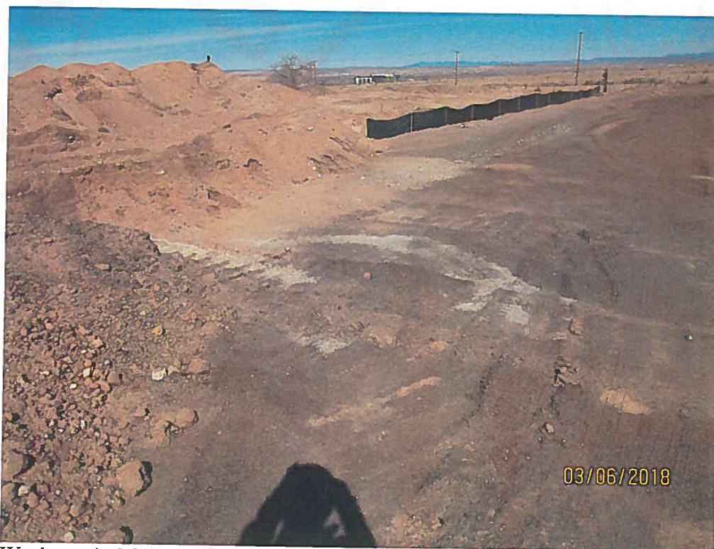
Wash-out in Modesto. No wash-out facility on-site.