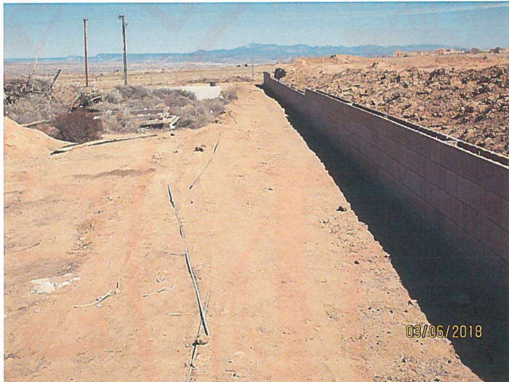
Disturbed area outside project boundaries with no sediment BMPs.