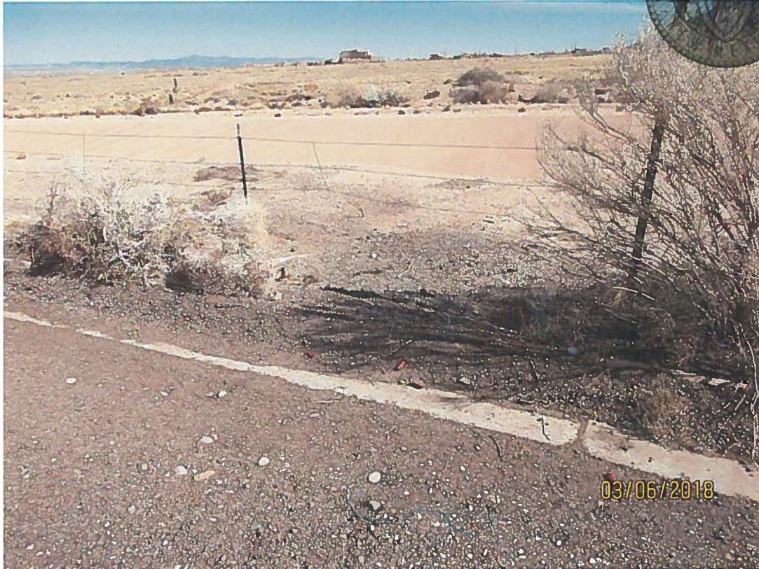
No sediment BMP at inlet to channel.