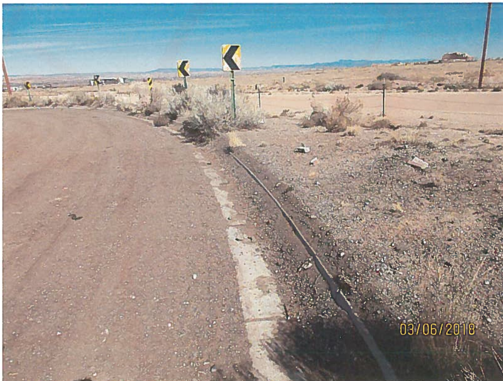
Sediment in gutter in the easement street.