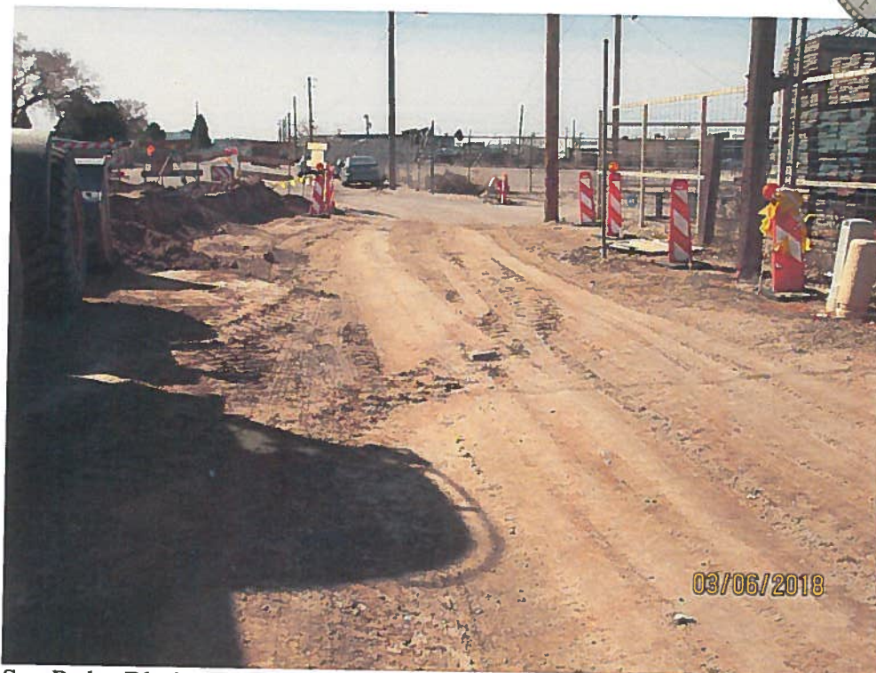
San Pedro Blvd covered in dirt. No BMPs