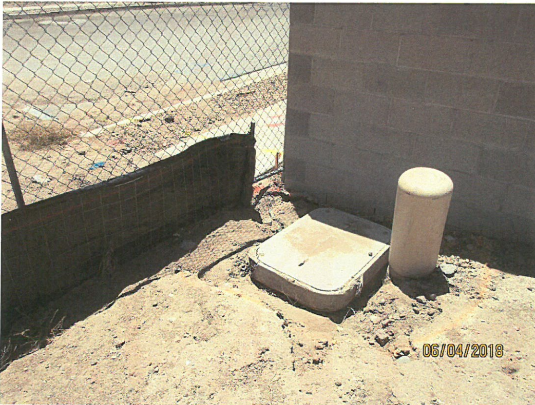
Gap in silt fence at site discharge location.