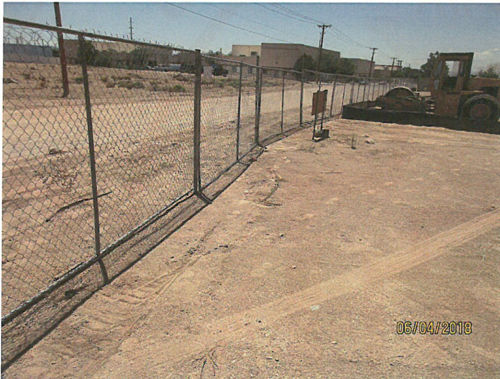
Area where a sediment BMP (silt fence is required).