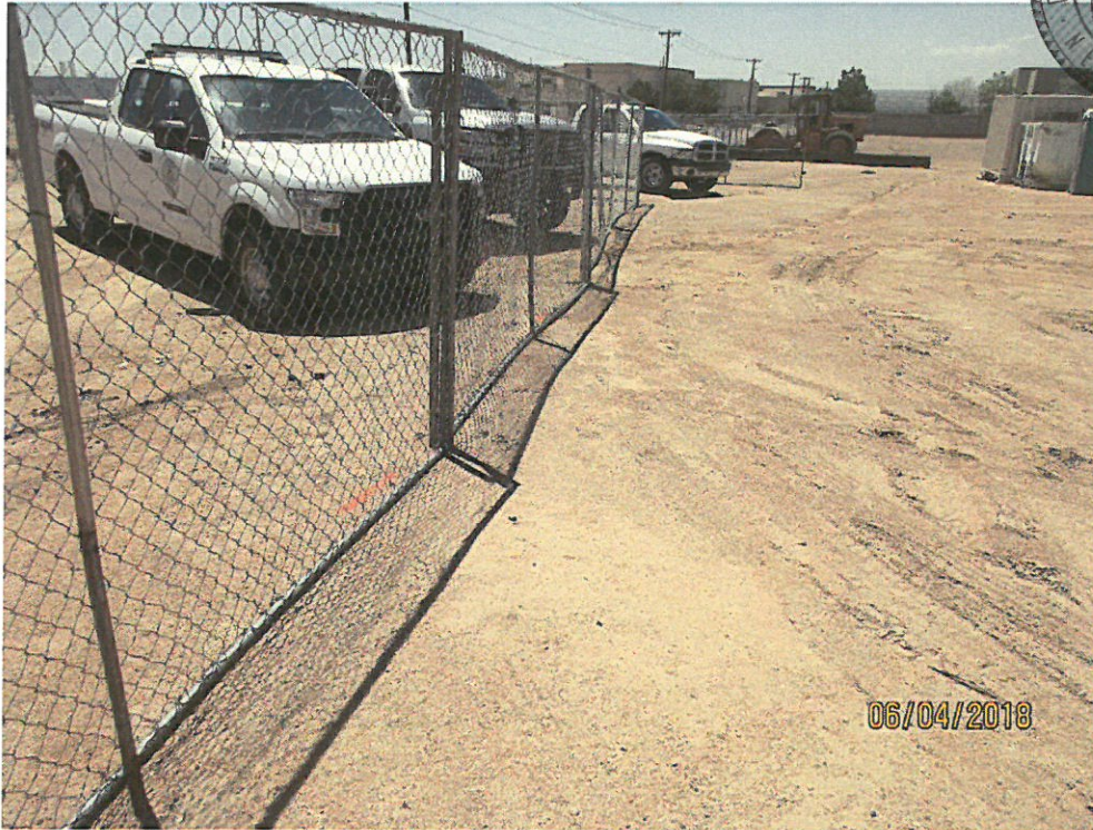
Adjoining lot to the east disturbed/graded as part of the site grading.