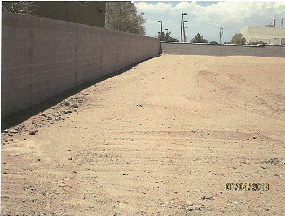
Grading of the site to drain to the southwest corner and there is no pond.