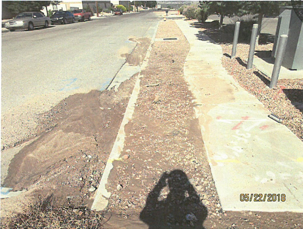
Sediment discharged to City street during storm on 5-21-18.