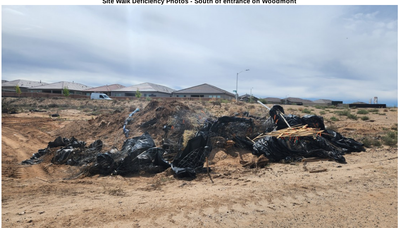
Site Walk Deficiency Photos - South of entrance on Woodmont