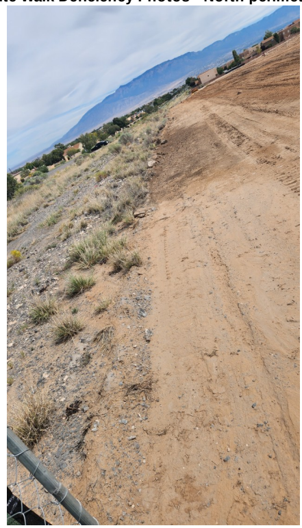
Site Walk Deficiency Photos - North perimeter