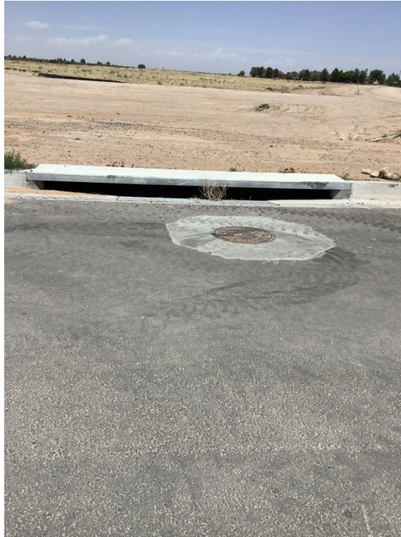
Site Walk Deficiency Photos - Girona