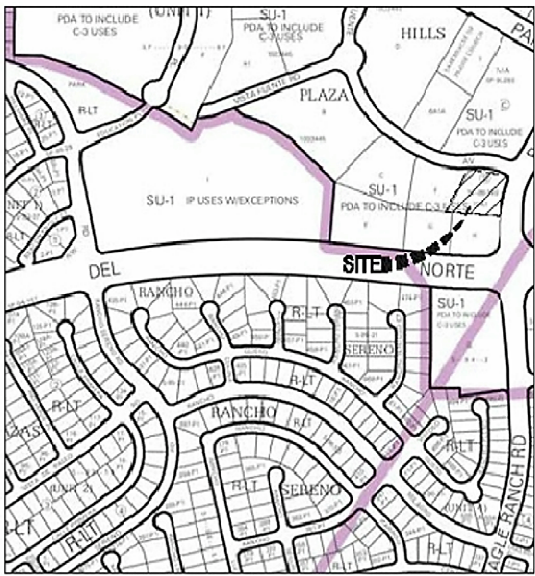
ZONE ATLAS PAGE: C-12