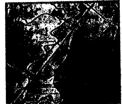
SOILS MAP REFERENCE: SCS BERNALILLO COUNTY SOIL SURVEY SHEET NO. 10