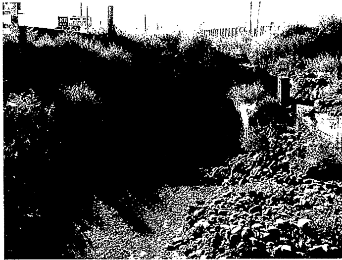
Existing 30" CMP that outfalls to the North Diversion Channel Between El Pueblo Road and the Railroad Tracks

Prepared for: Albuquerque Metropolitan Arroyo Flood Control Authority