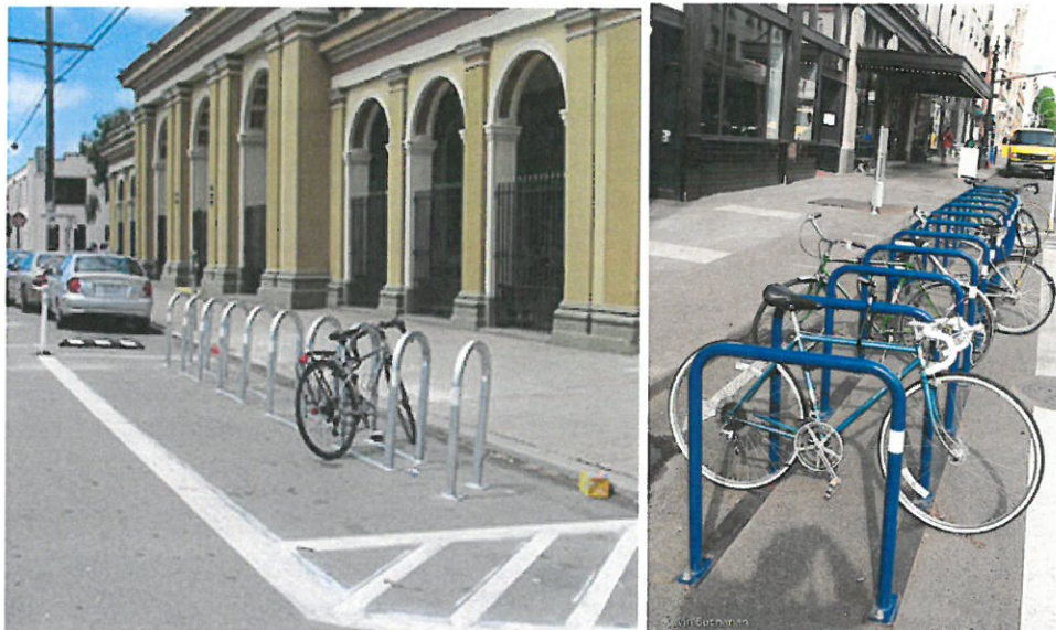
Figure 3.8-3 Bicycle Parking Corral Examples