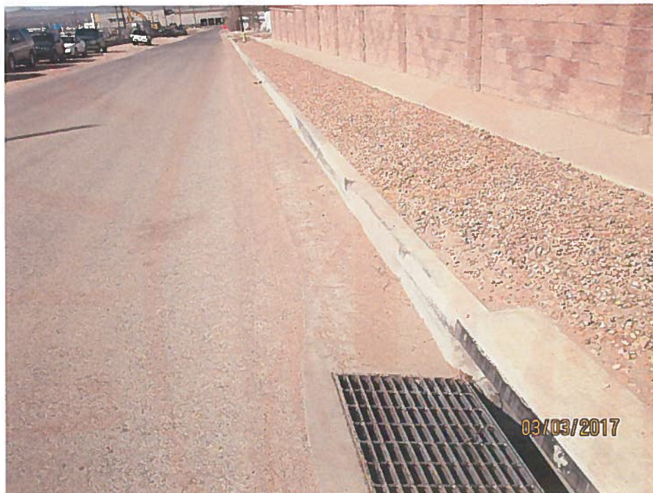
Sediment in gutter Oakland Ave.