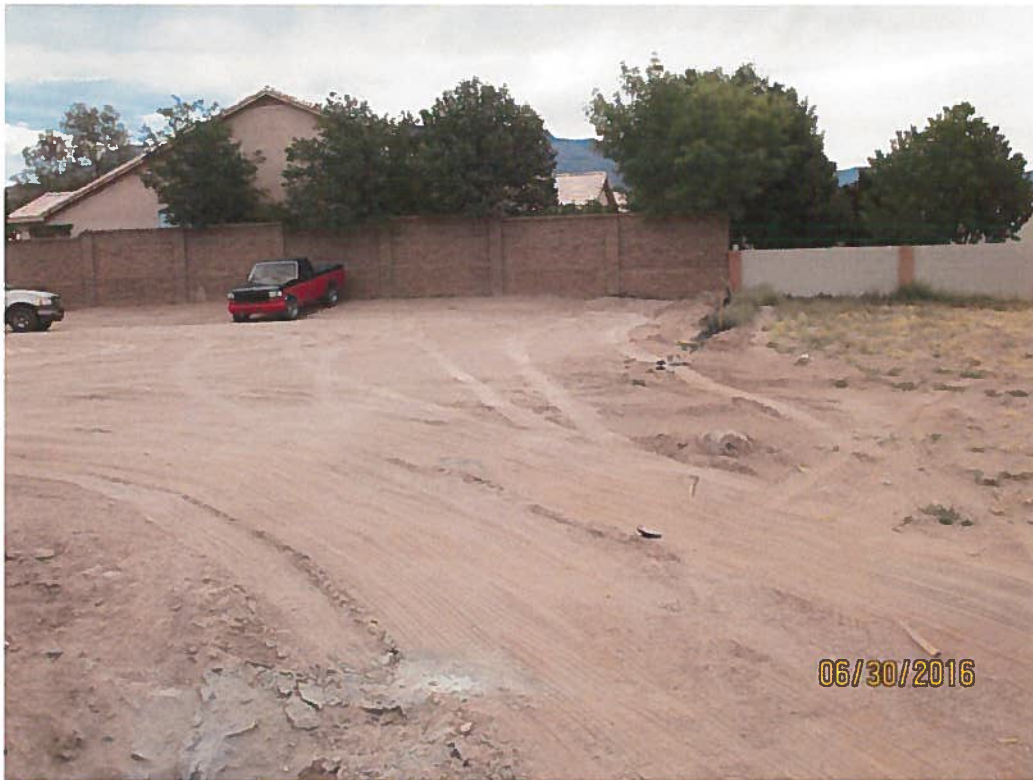
No sediment BMP southern edge.