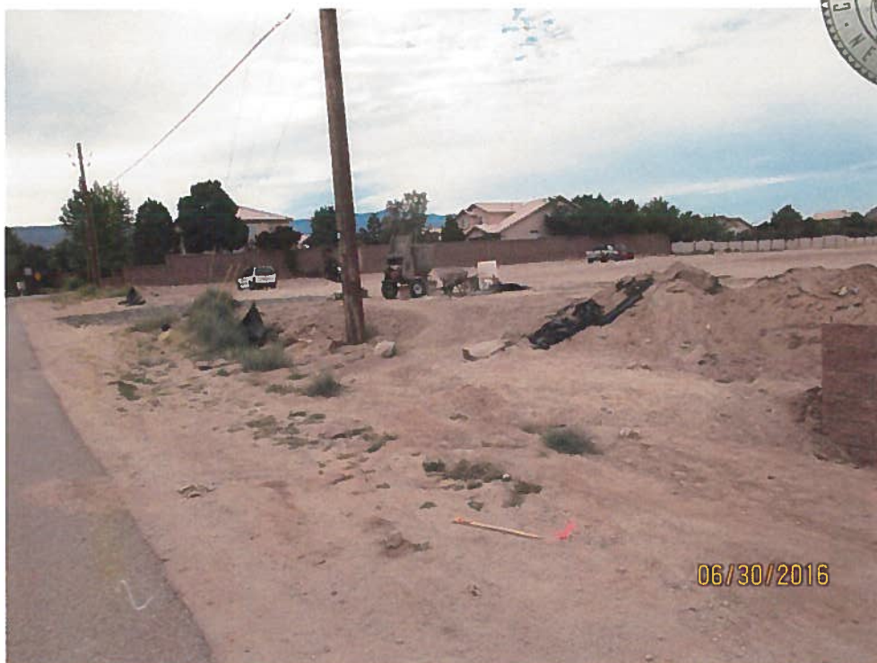
No sediment BMP Signal Ave. west of track-out pad.