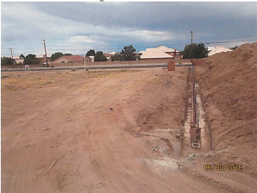
Access/staging area outside of project boundaries.