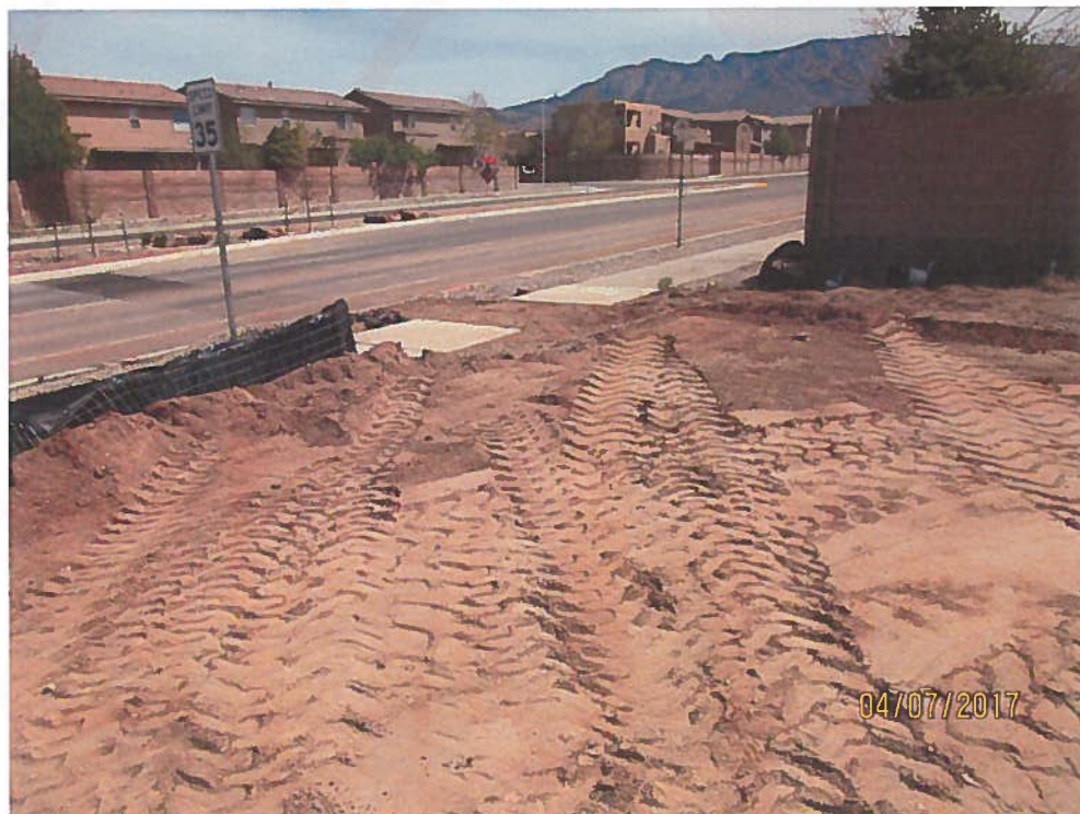
Gap in silt fence northeast corner.