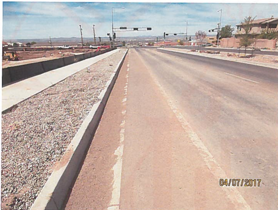
Alameda Blvd looking west to Louisiana.