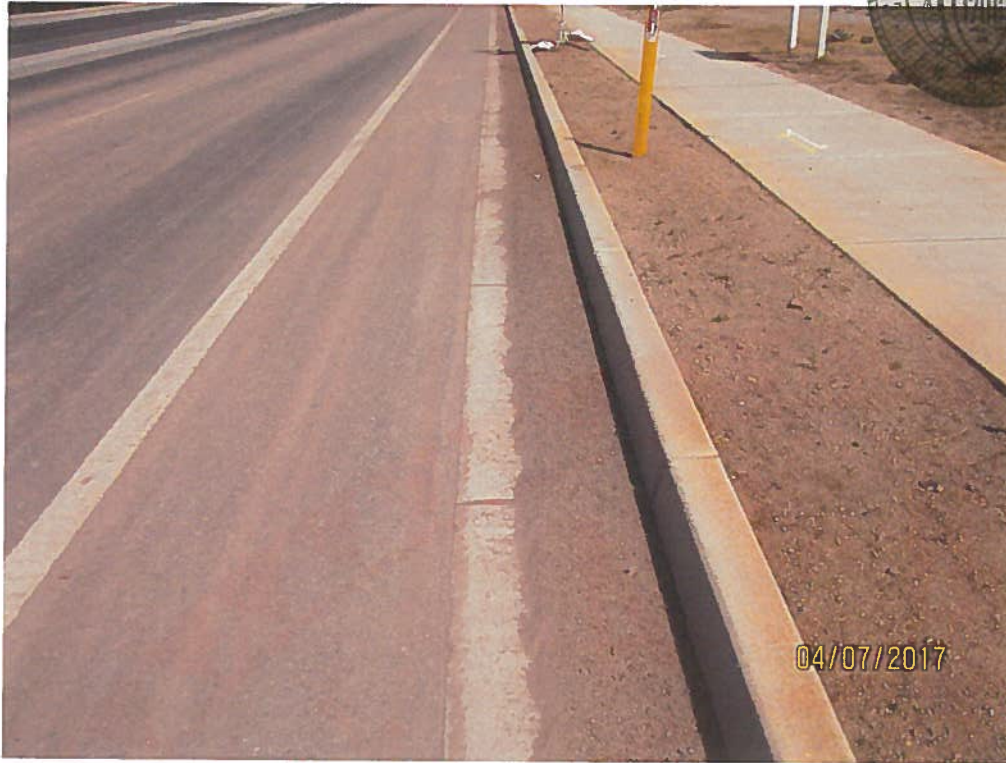
Louisiana Blvd north of Signal Ave.