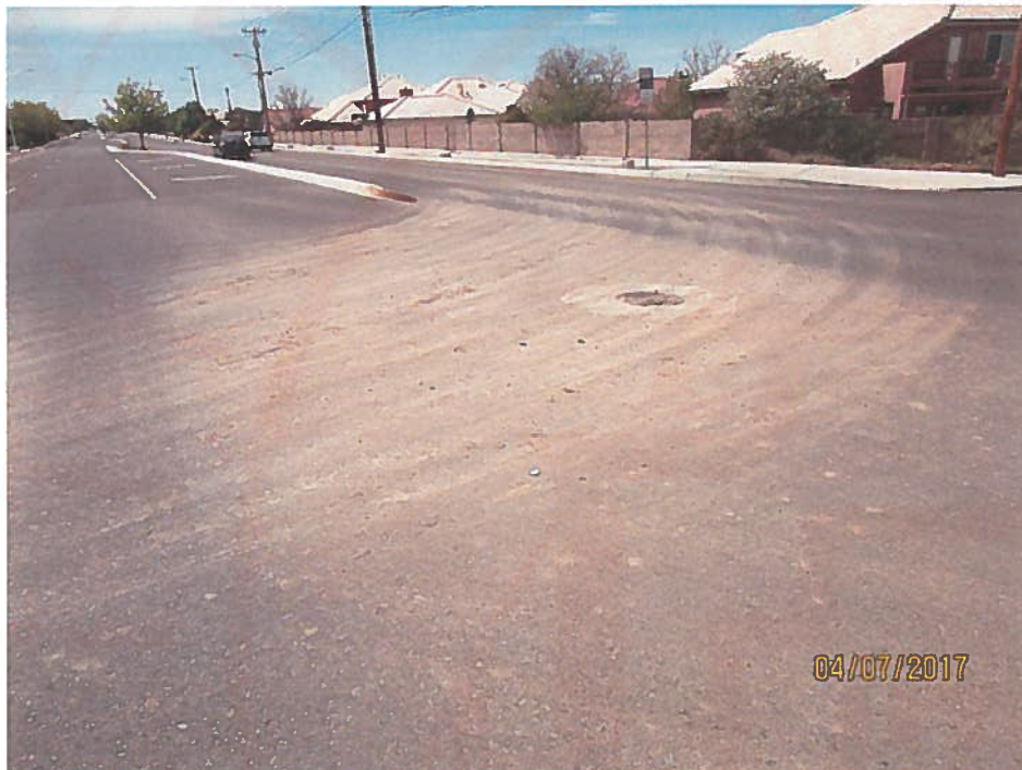
Some of the trucks are turning south onto Louisiana.