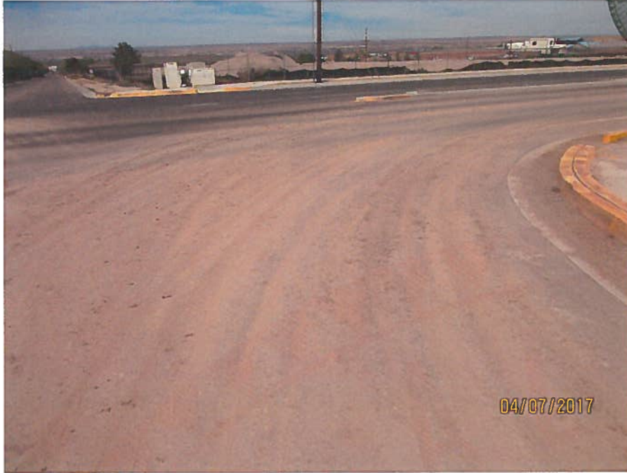
Intersection of Signal Ave and Louisiana Blvd.