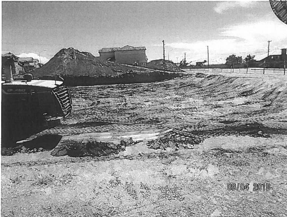
Grading occurring at site.